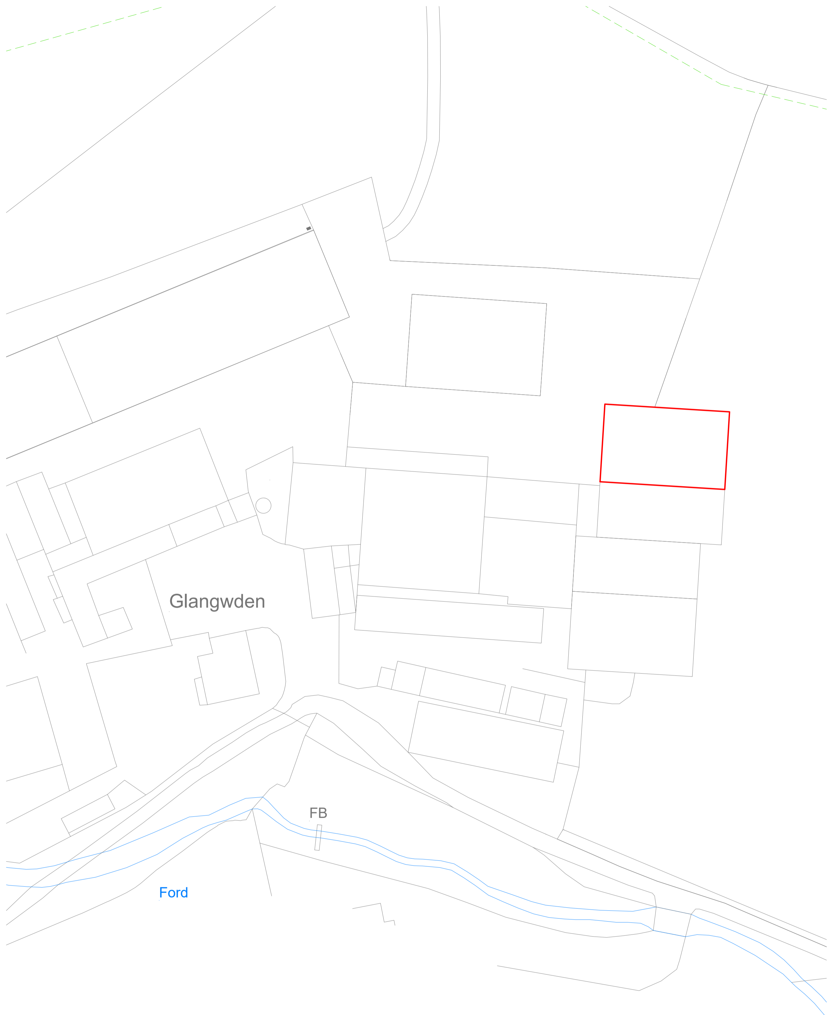
Block Plan - 1:500

THIS DRAWING IS TO BE READ IN CONJUNCTION WITH ALL RELATED DRAWINGS. ALL DIMENSIONS MUST BE CHECKED AND VERIFIED ON SITE BEFORE COMMENCING ANY WORK OR PRODUCING SHOP DRAWINGS. THE ORIGINATOR SHOULD BE NOTIFIED IMMEDIATELY OF ANY DISCREPANCY. THIS DRAWING IS COPYRIGHT AND REMAINS THE PROPERTY ROGER PARRY & PARTNERS.