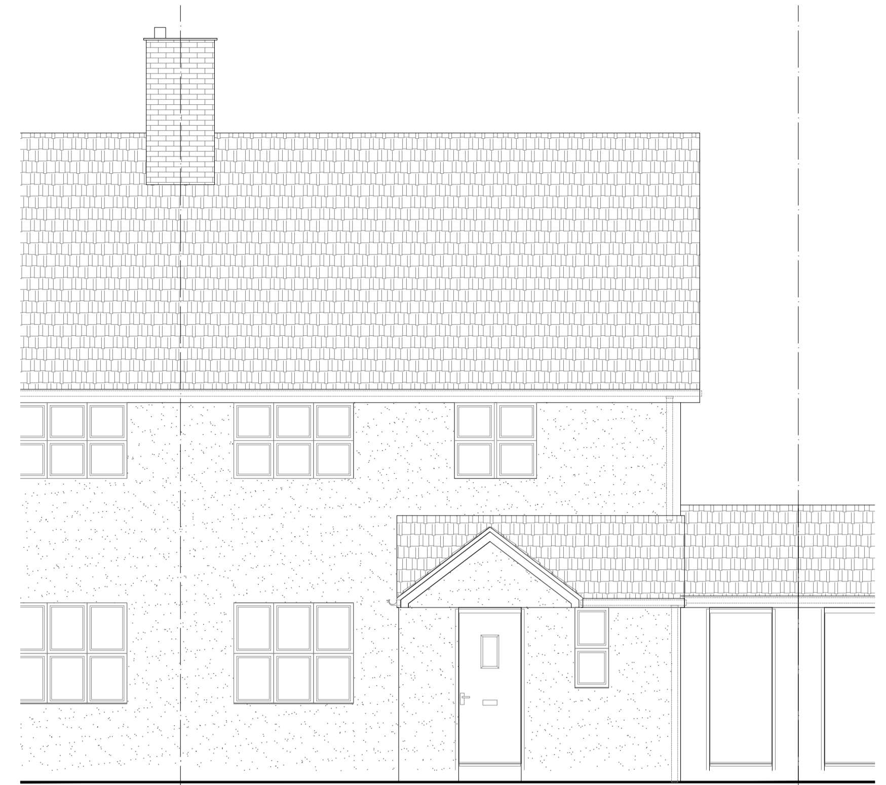
Existing Front Elevation (Scale = 1:50)