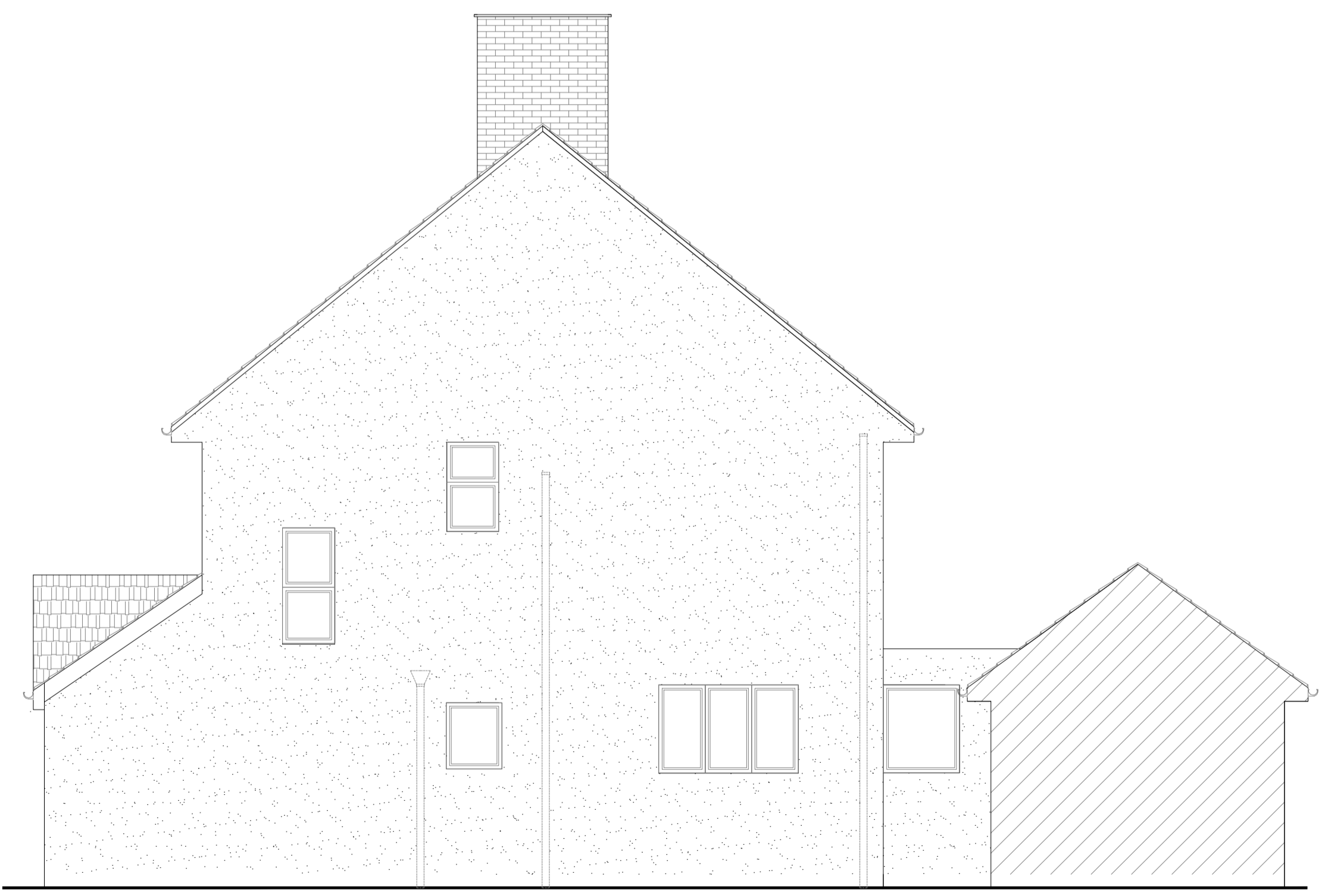
Existing Right Hand Side Elevation (Scale = 1:50)