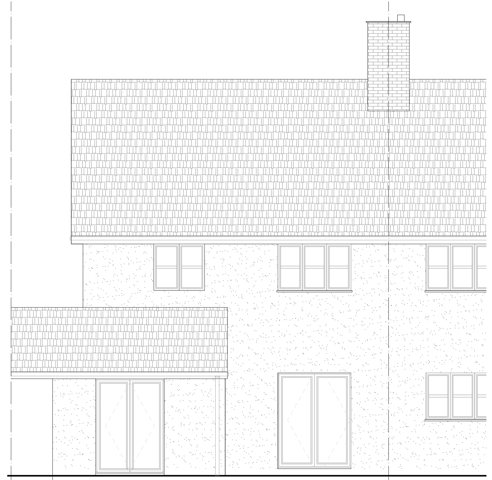
Existing Rear Elevation (Scale = 1:50)