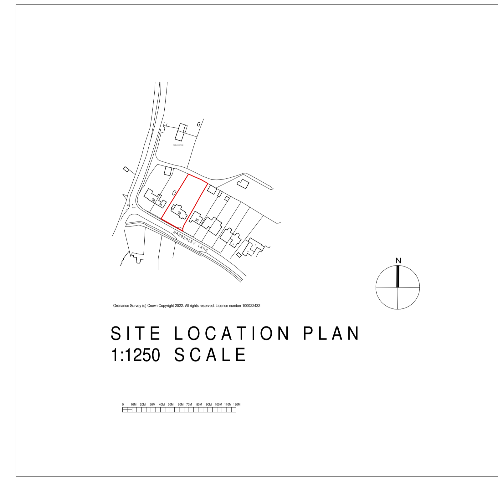
SITE LOCATION PLAN 1:1250 SCALE

COPYRIGHT The copyright of this drawing is vested in the designers and must not be reproduced without their consent in writing NOTE Contractors must verify dimensions before commencing any work, fabrication, ordering or shop drawings. Do not scale from this drawing.