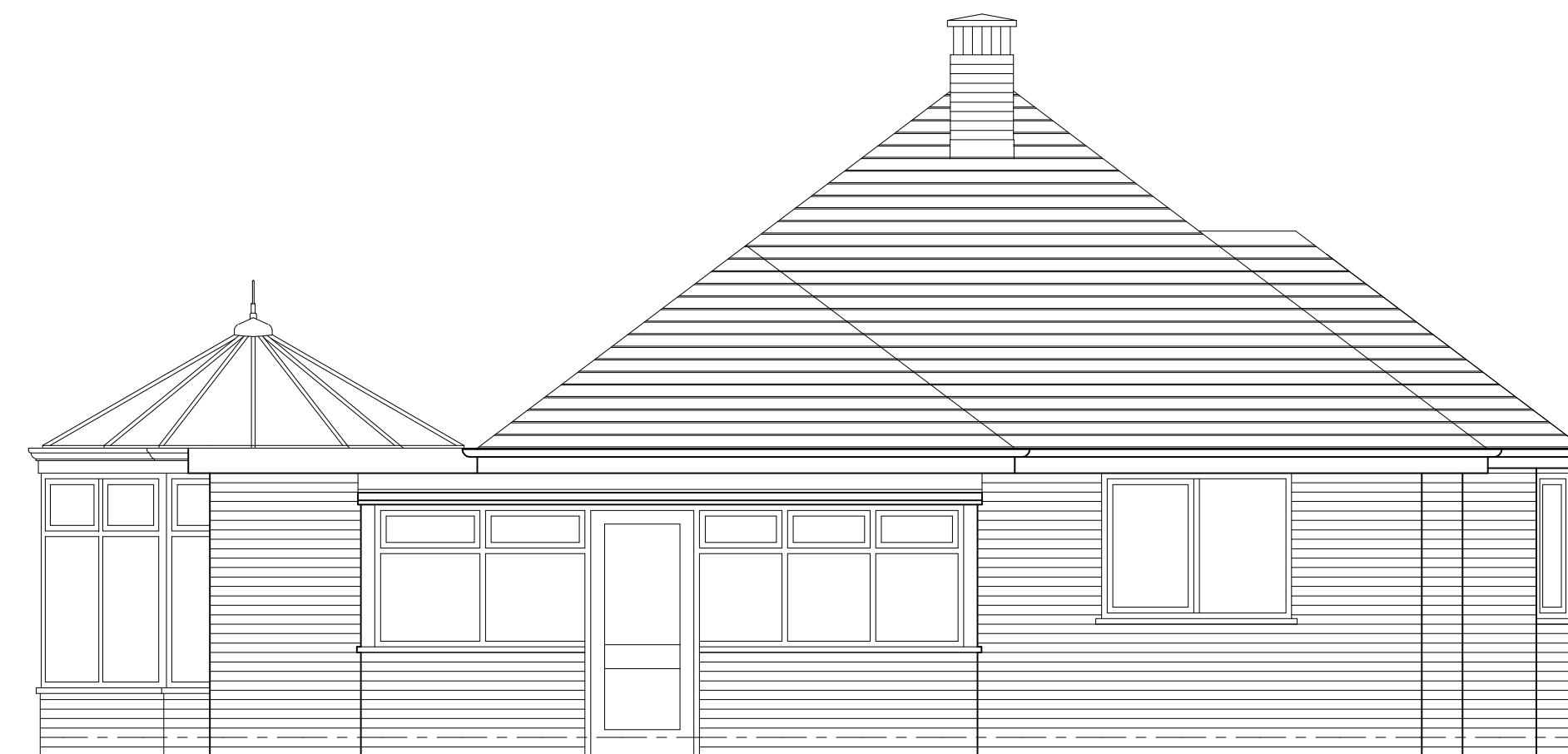
EXISTING SIDE ELEVATION - FACING NORTH WEST