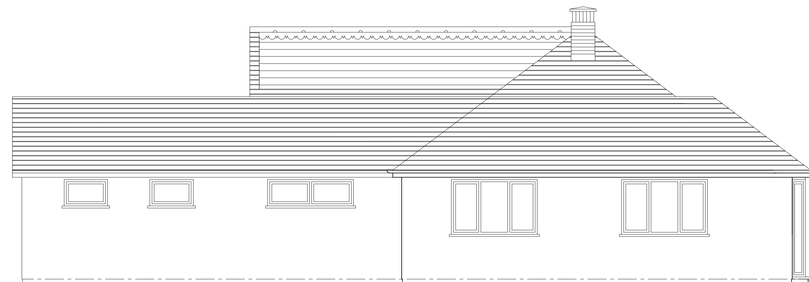
PROPOSED SIDE ELEVATION - FACING SOUTH EAST