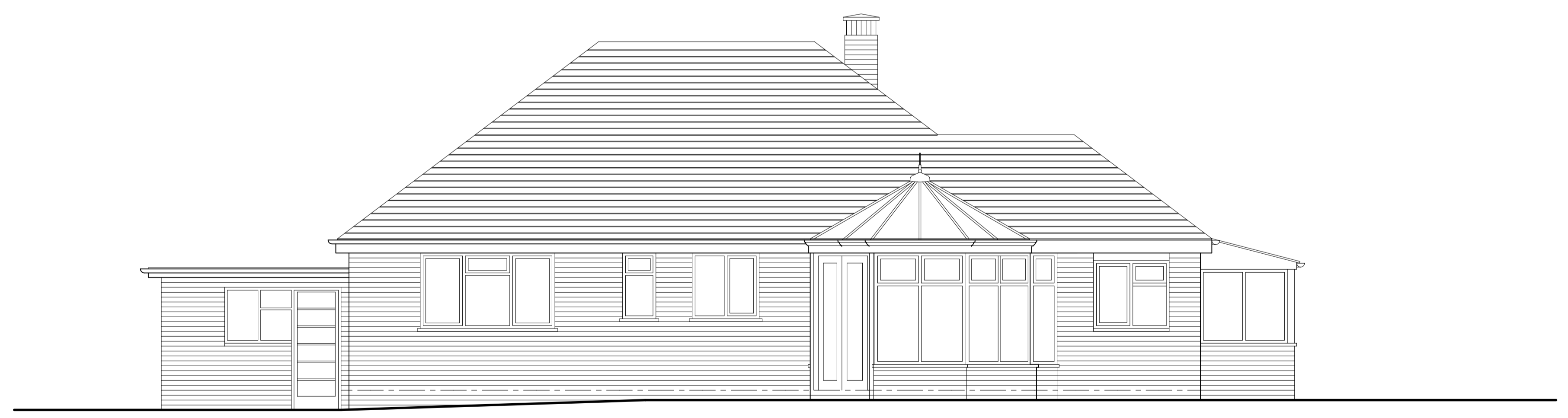
EXISTING REAR ELEVATION - FACING NORTH EAST

EXISTING EXTERNAL FINISHES PITCHED ROOF: SLATE ROOF COVERING EXTERNAL WALLS: FACING BRICKWORK WINDOWS: UPVC & TIMBER EXTERNAL DOORS: UPVC & TIMBER