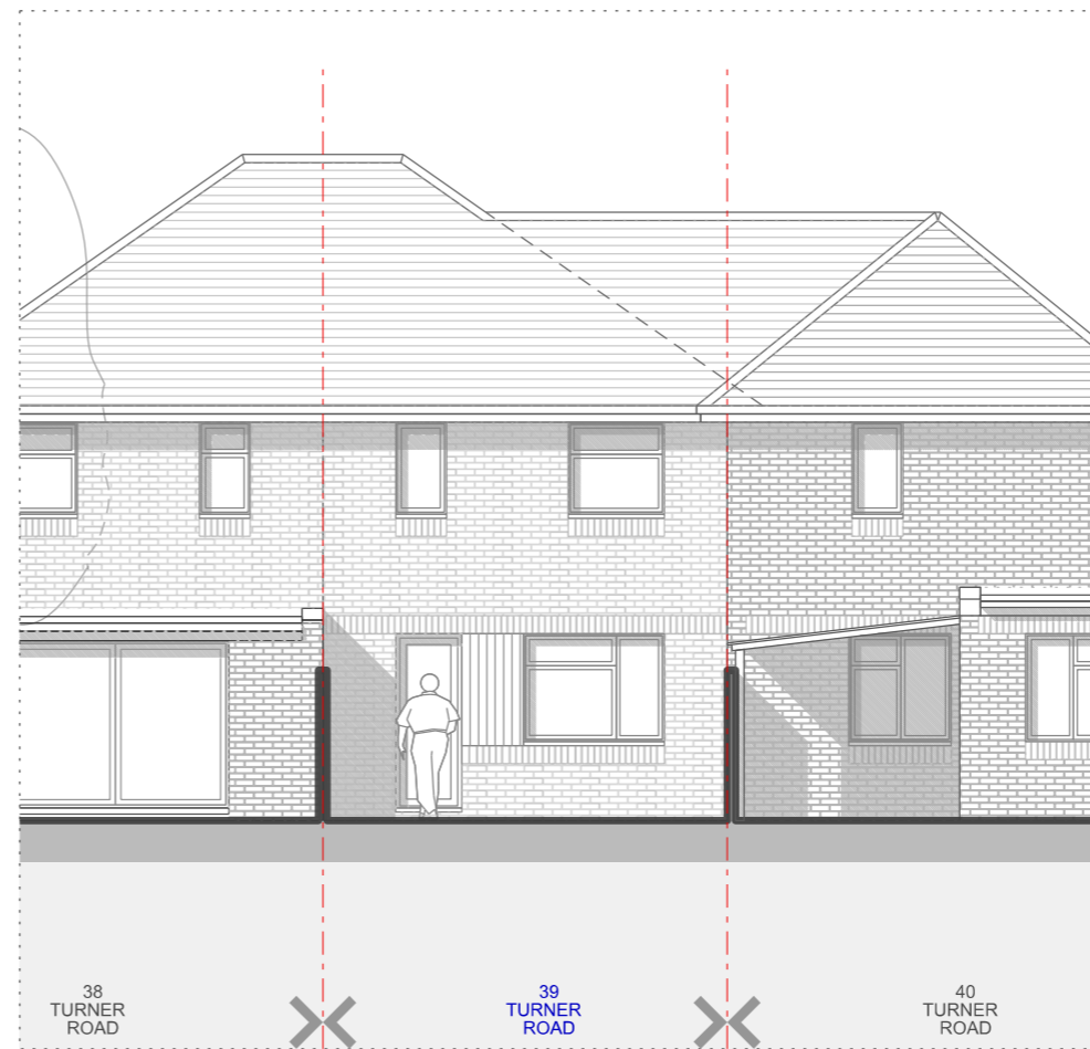
SOUTH (REAR) ELEVATION - EXISTING SCALE 1:100 @ A3