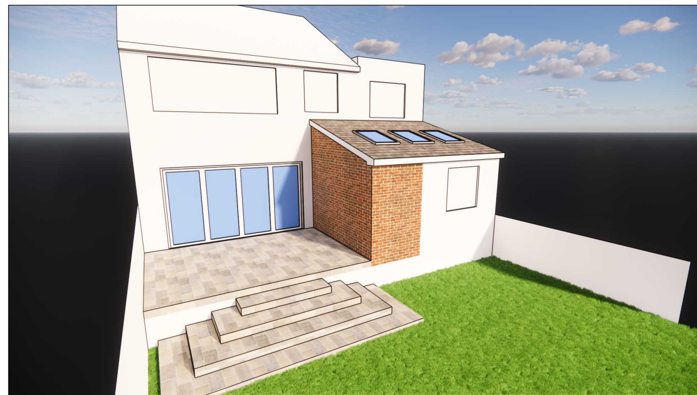
3D SKETCH VIEW