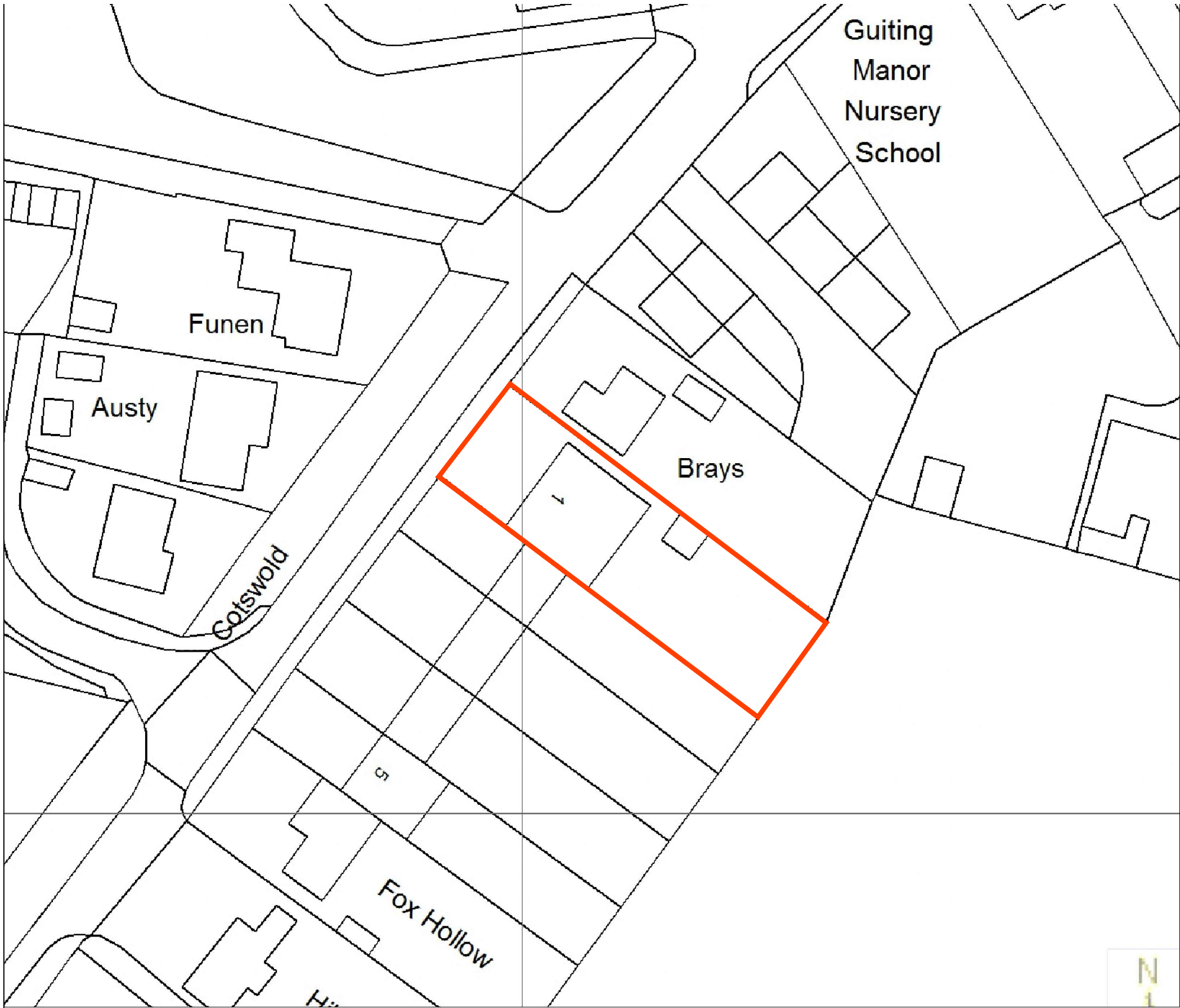
Block Plan Sc 1:500