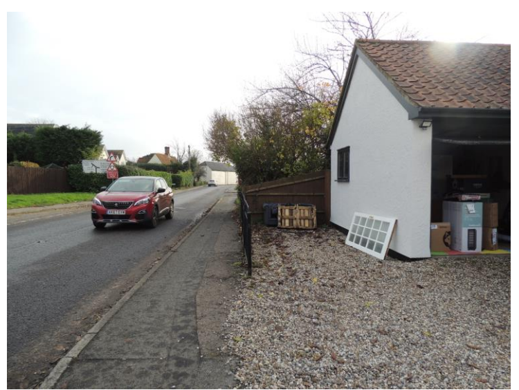
Photo 14: Looking southwards. Note gravel area and proximity to road