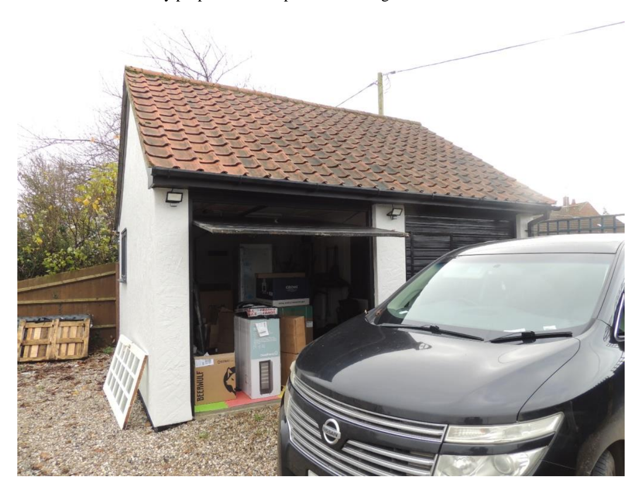
Photo 1: Northern elevation. The proposal is for an upper floor to the building

As part of a planning proposal involving a garage at New Cottage, Dunmow Road, Leaden Roding, Dunmow, Essex CM6 1QA, a site visit was conducted on 2<sup>nd</sup> December 2022 to determine whether the site had the potential to be occupied by protected species, which would be affected if any proposed development were to go ahead.