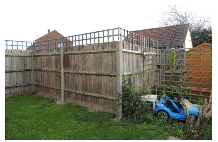
Photo 17: Maintained garden of New Cottage with garage roof in background