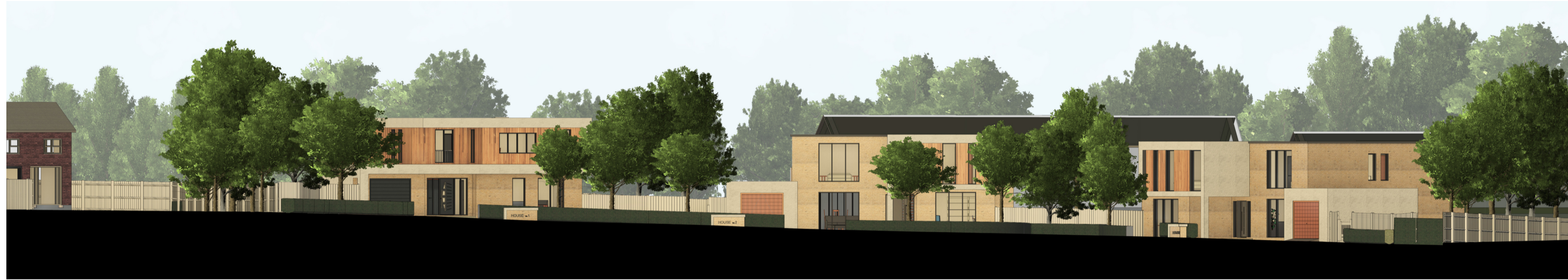
Site Elevation from Inside the Site 1:200