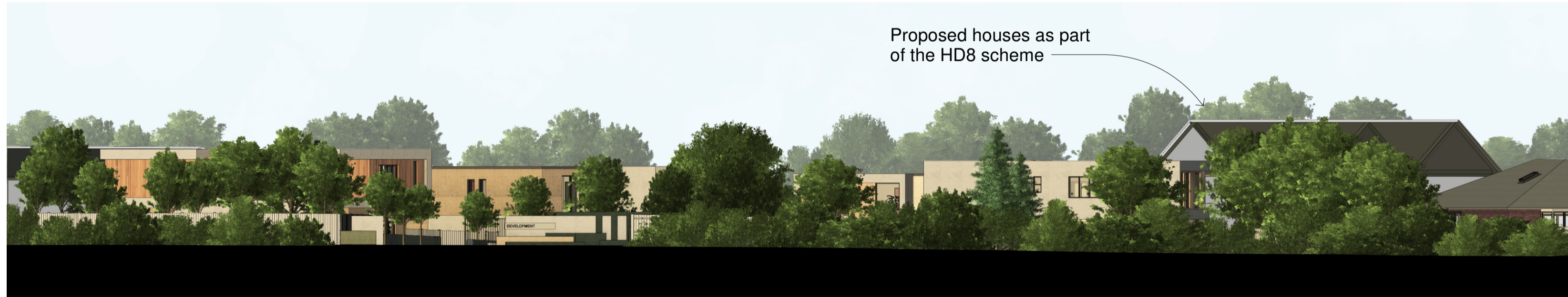
Site Elevation from Old Gloucester Road 1:200