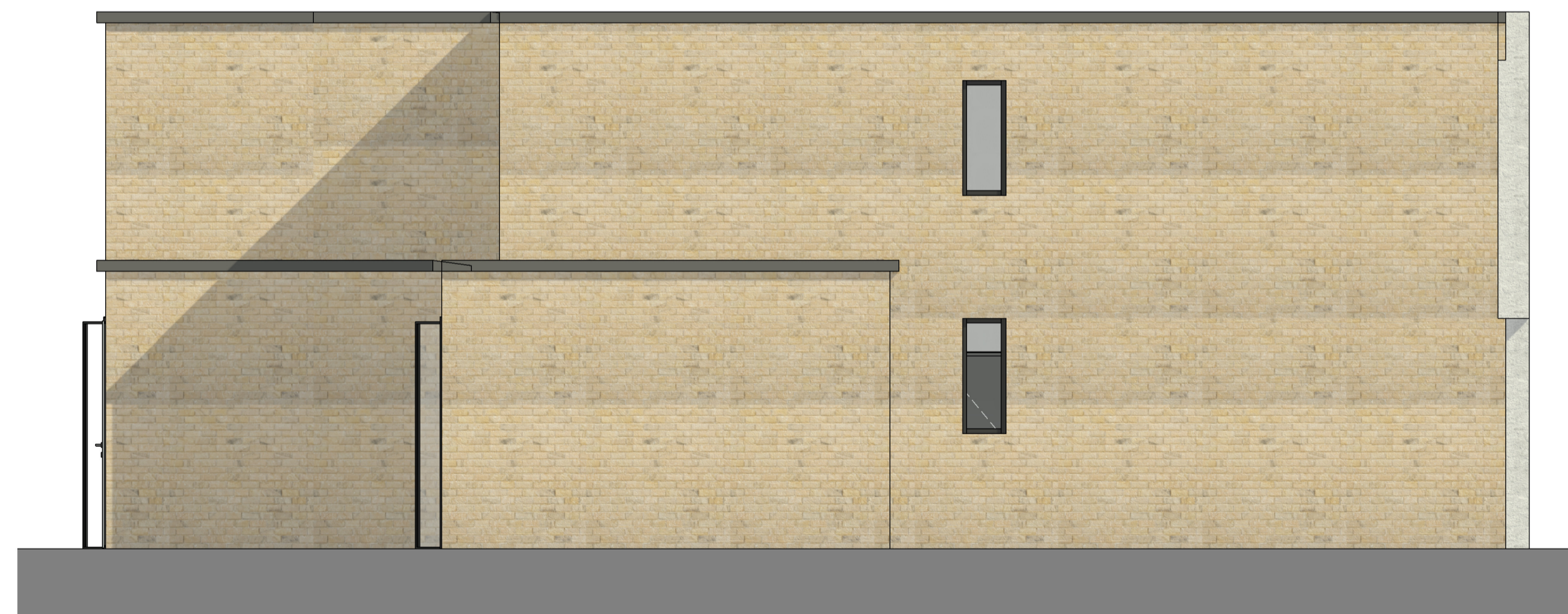
4 Side Elevation 1 : 50