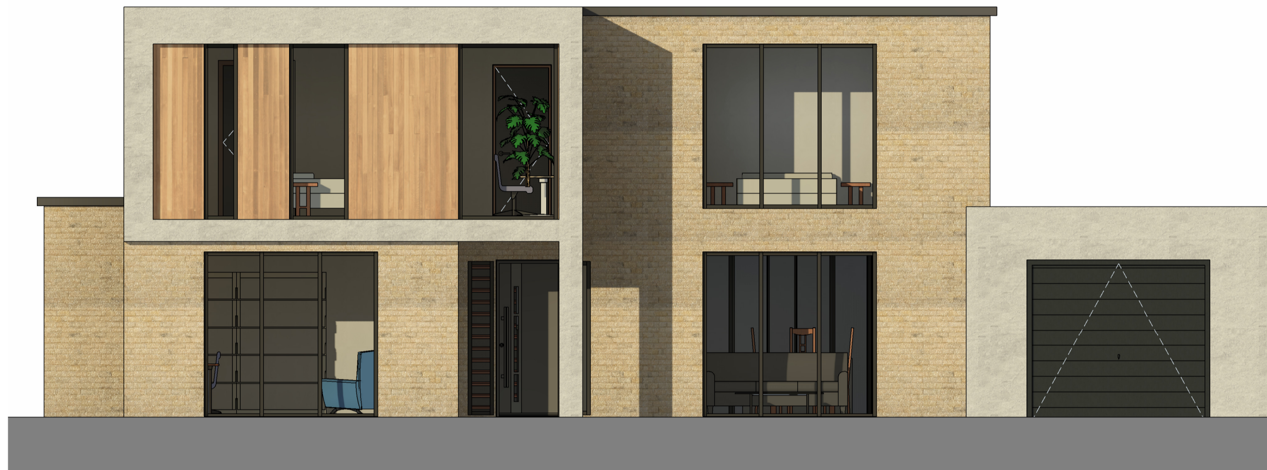
1 Front Elevation 1 : 50