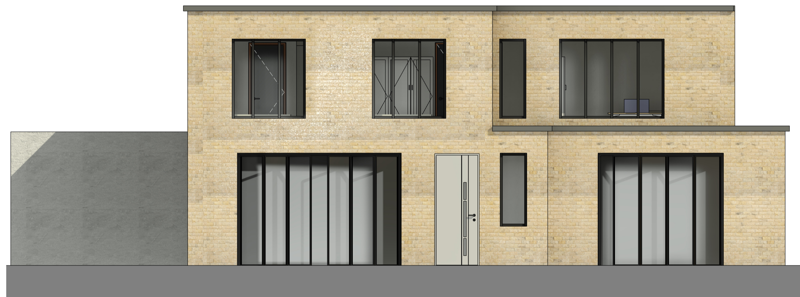
2 Back Elevation 1 : 50