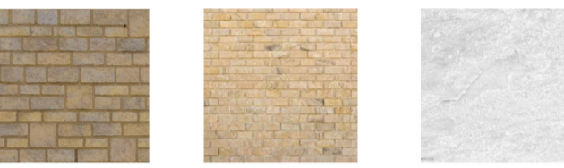
Cotswold Stone Yellow Multistock Brick White Render