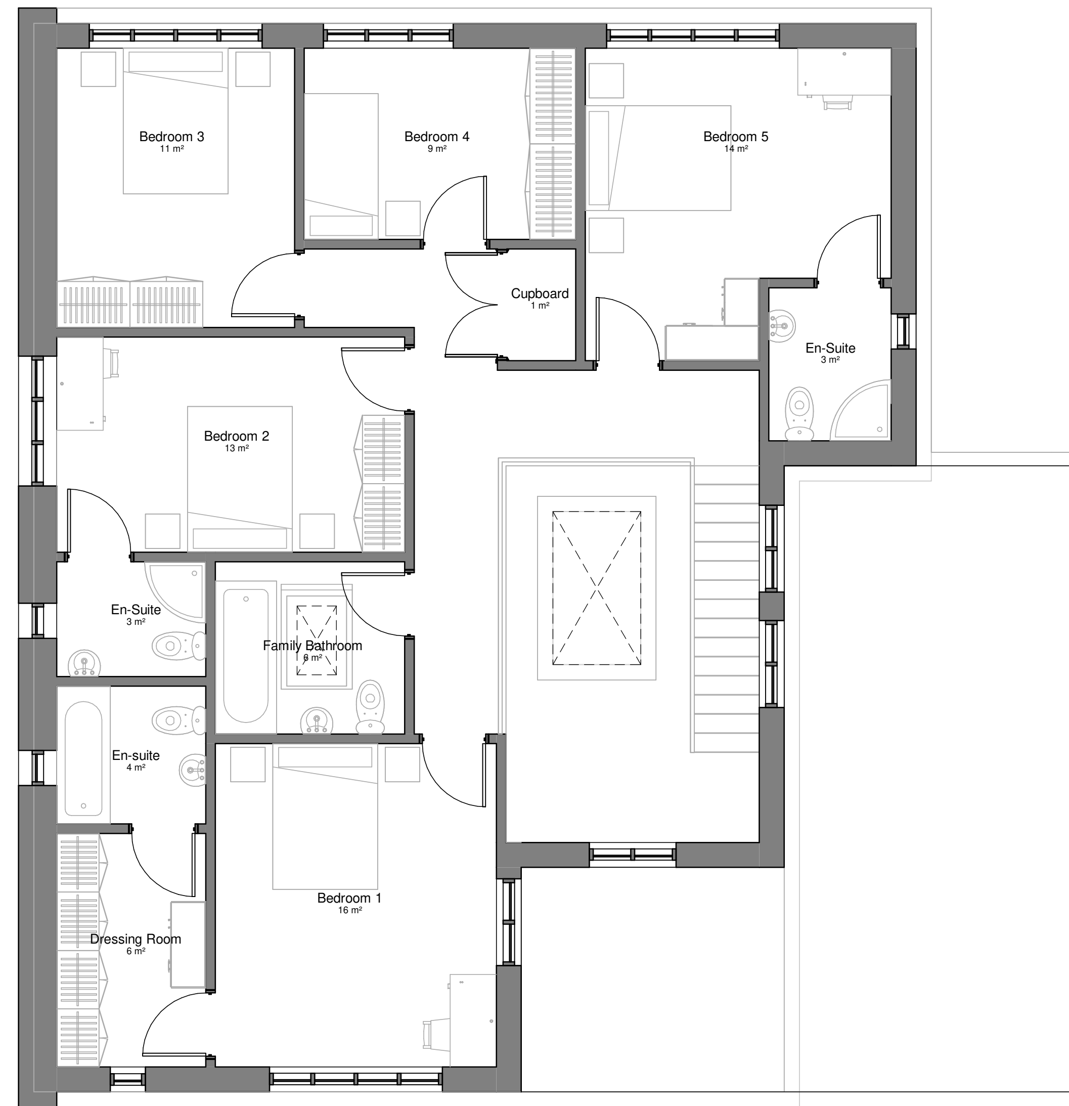
2 First Floor - As Proposed 1 : 50