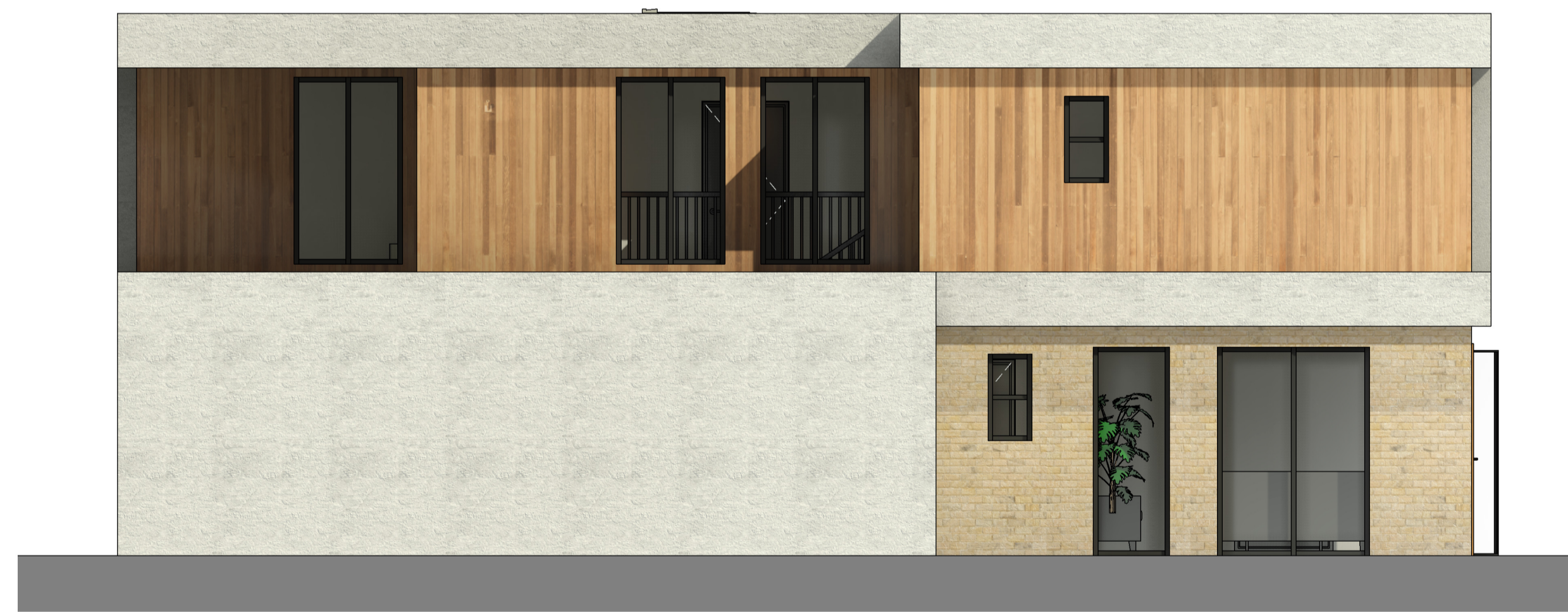
4 Side Elevation 1 : 50