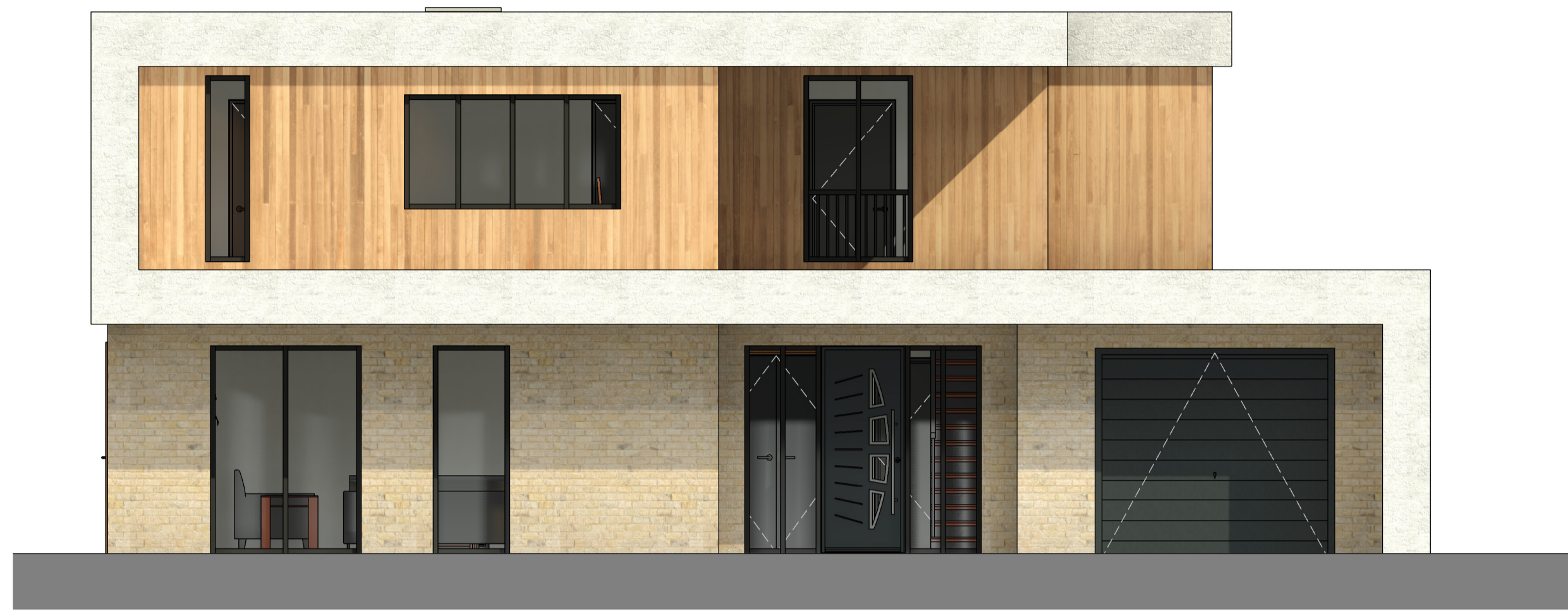
1 Front Elevation 1 : 50