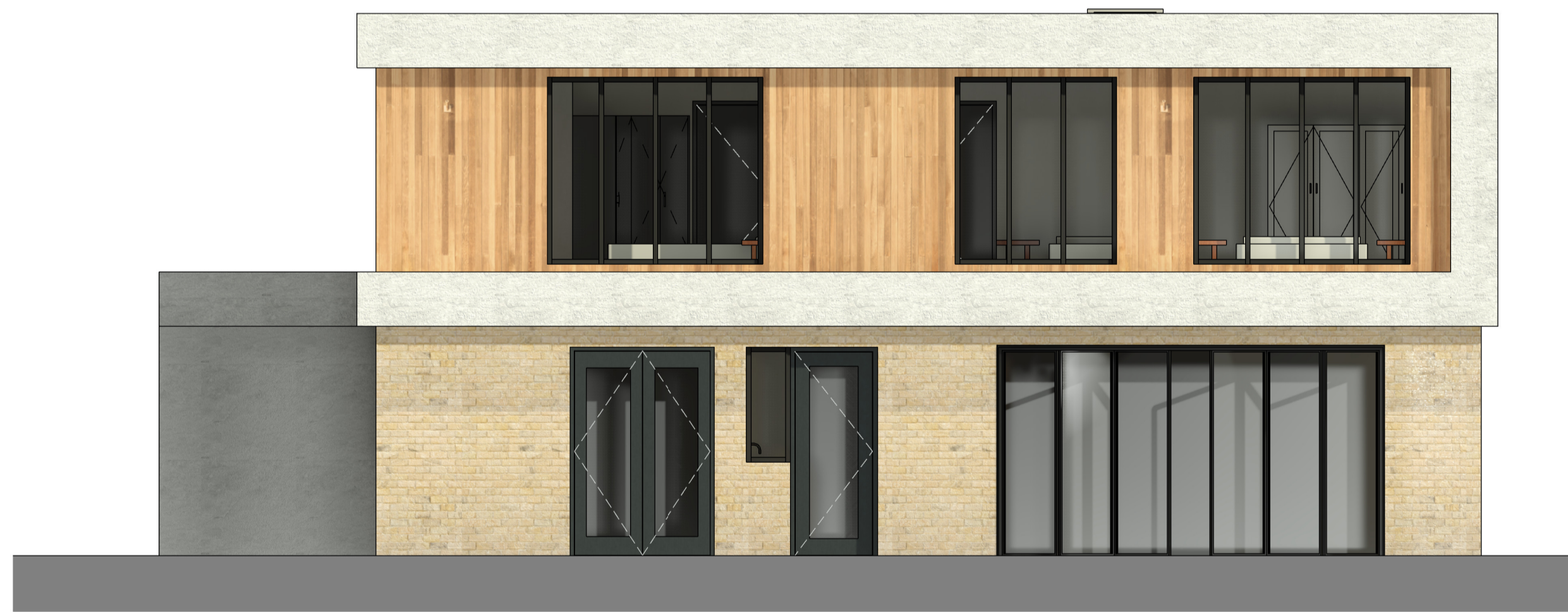
2 Back Elevation 1 : 50