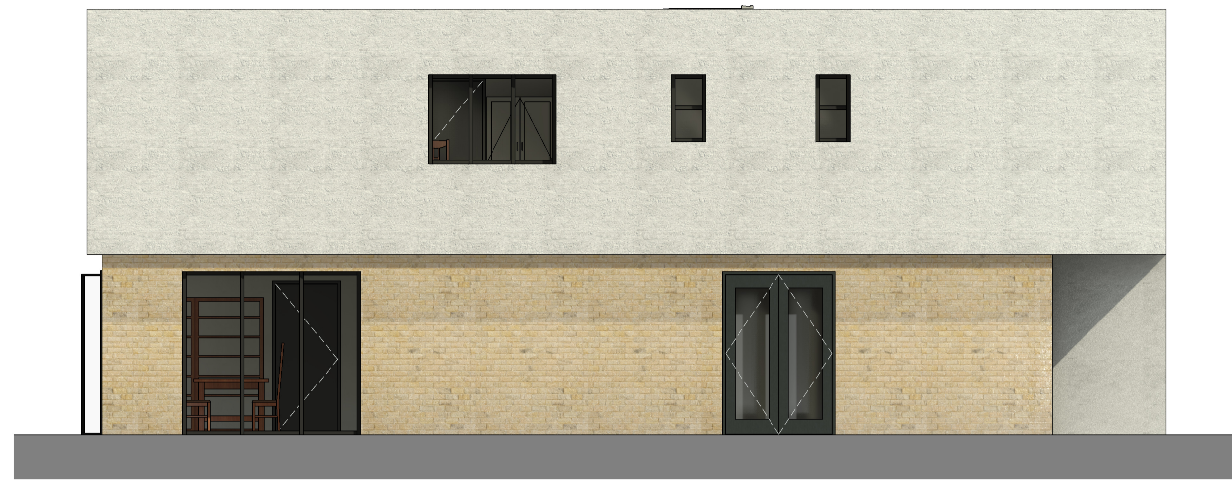
3 Garage Elevation 1 : 50