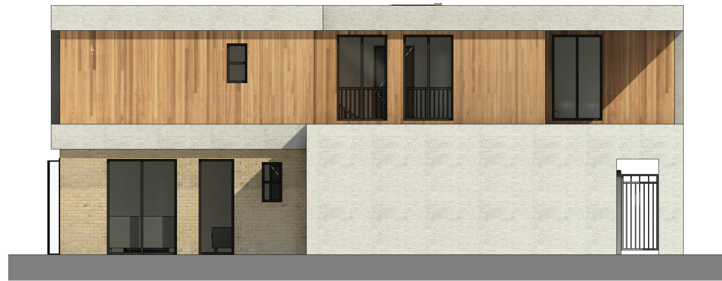
3 Garage Elevation 1 : 50