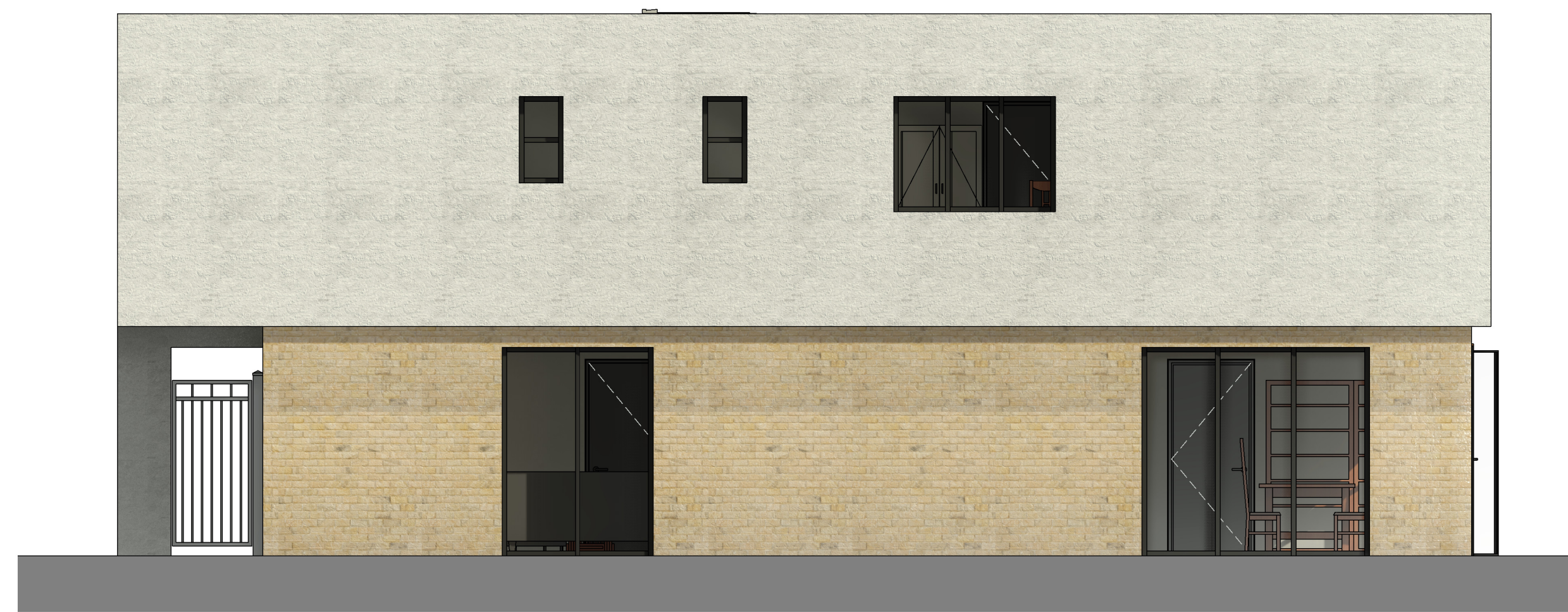
4 Side Elevation 1 : 50