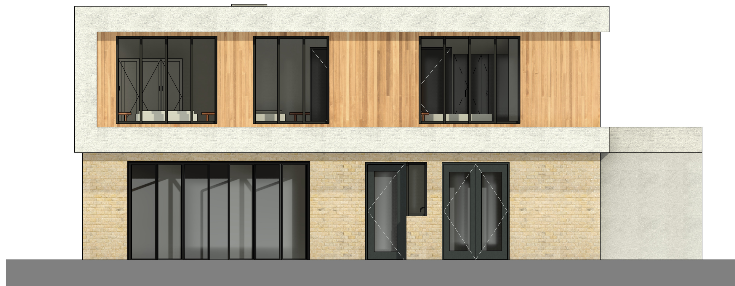
2 Back Elevation 1 : 50