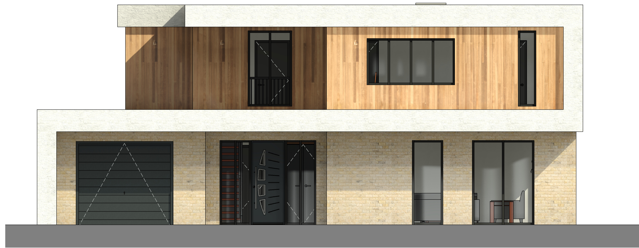
1 Front Elevation 1 : 50