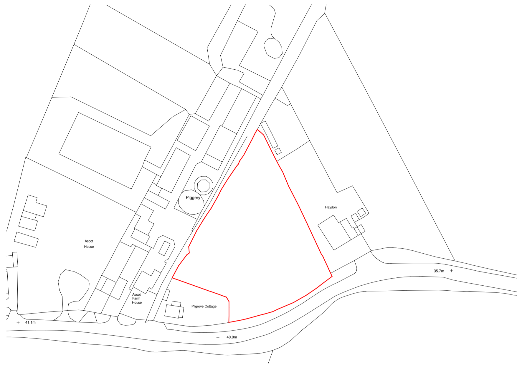
2 Location Plan 1 : 1250