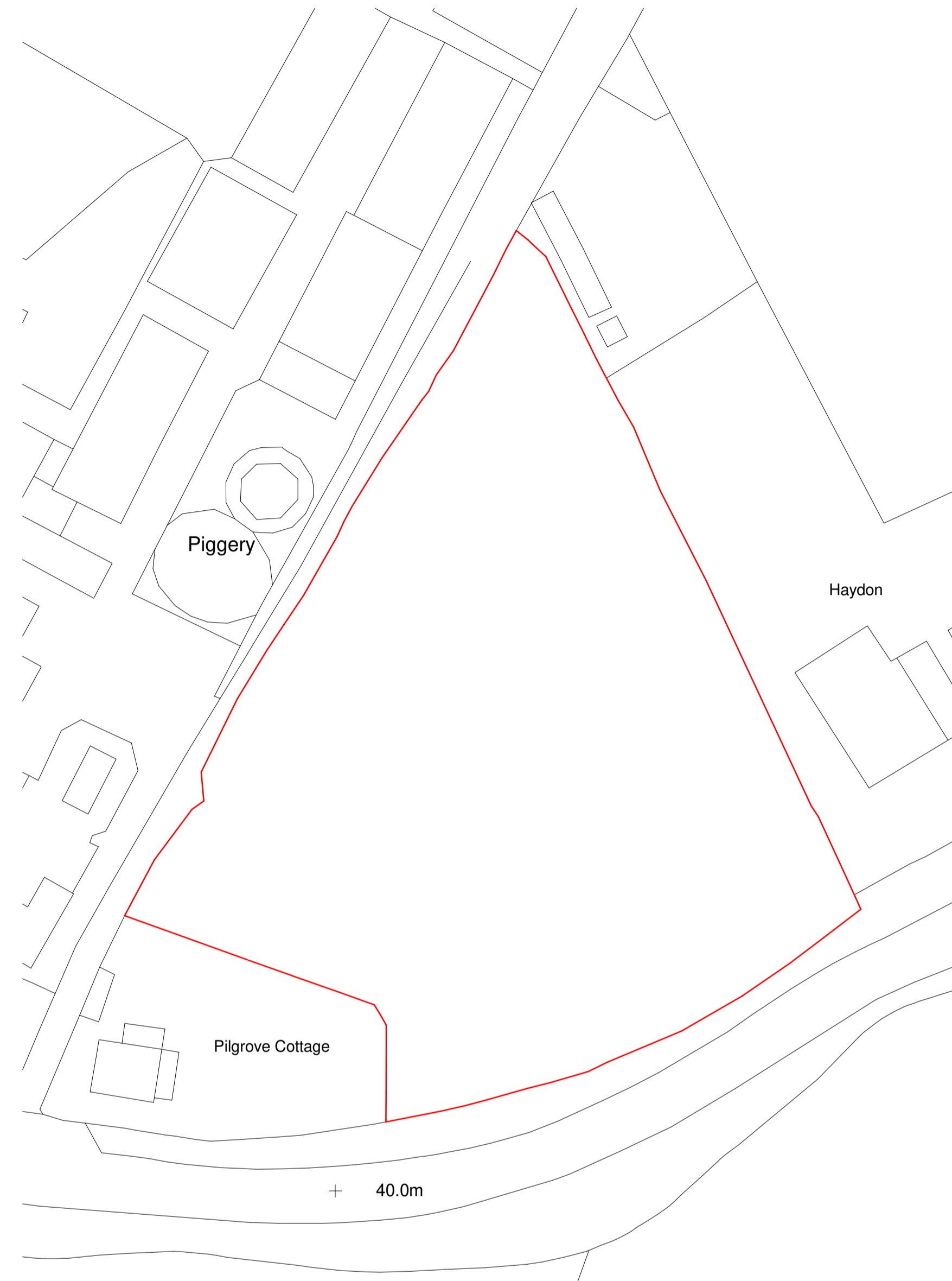
1 Site Plan 1 : 500