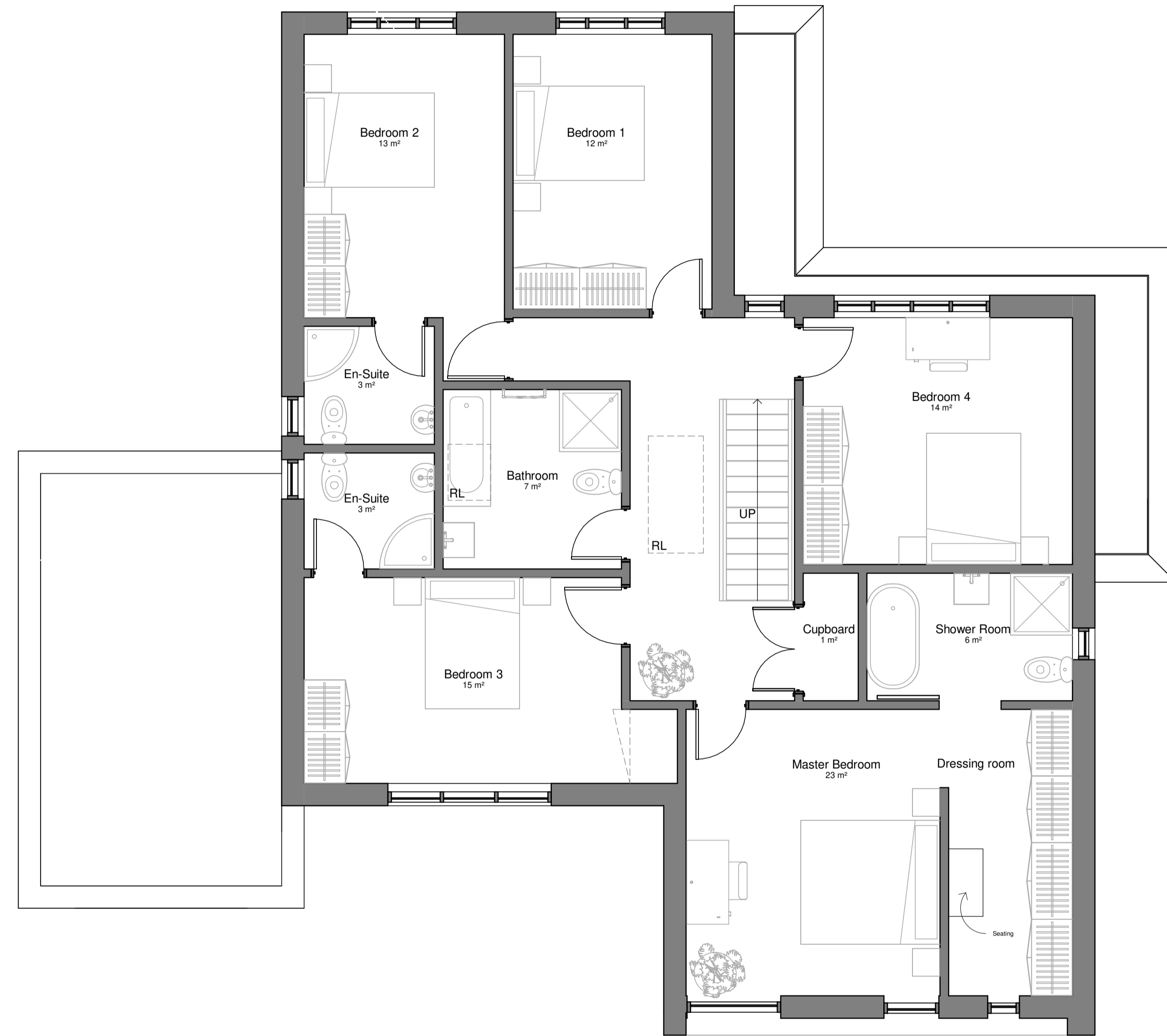
2 First Floor - As Proposed 1 : 50