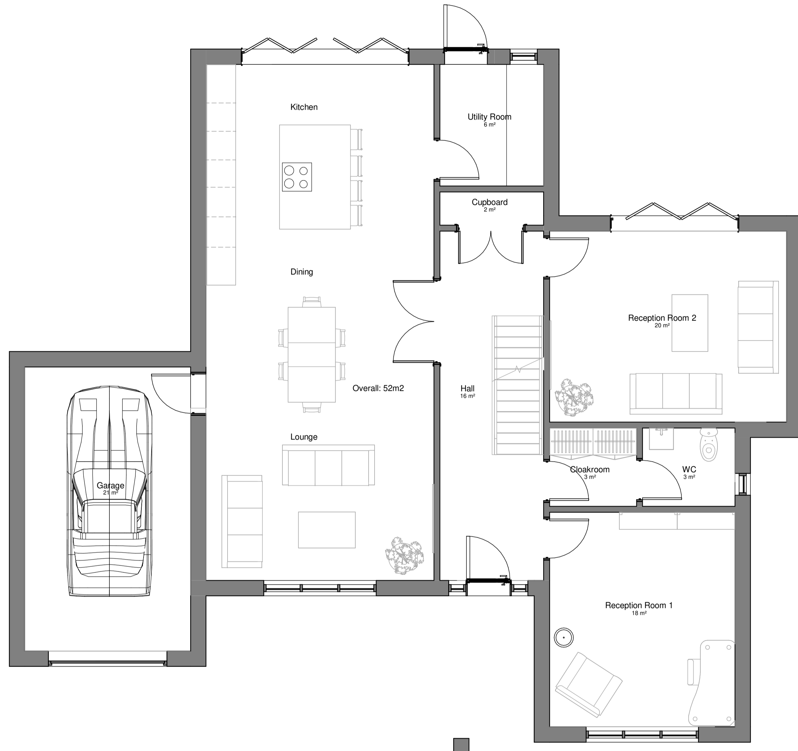
1 Ground Floor - As Proposed 1 : 50