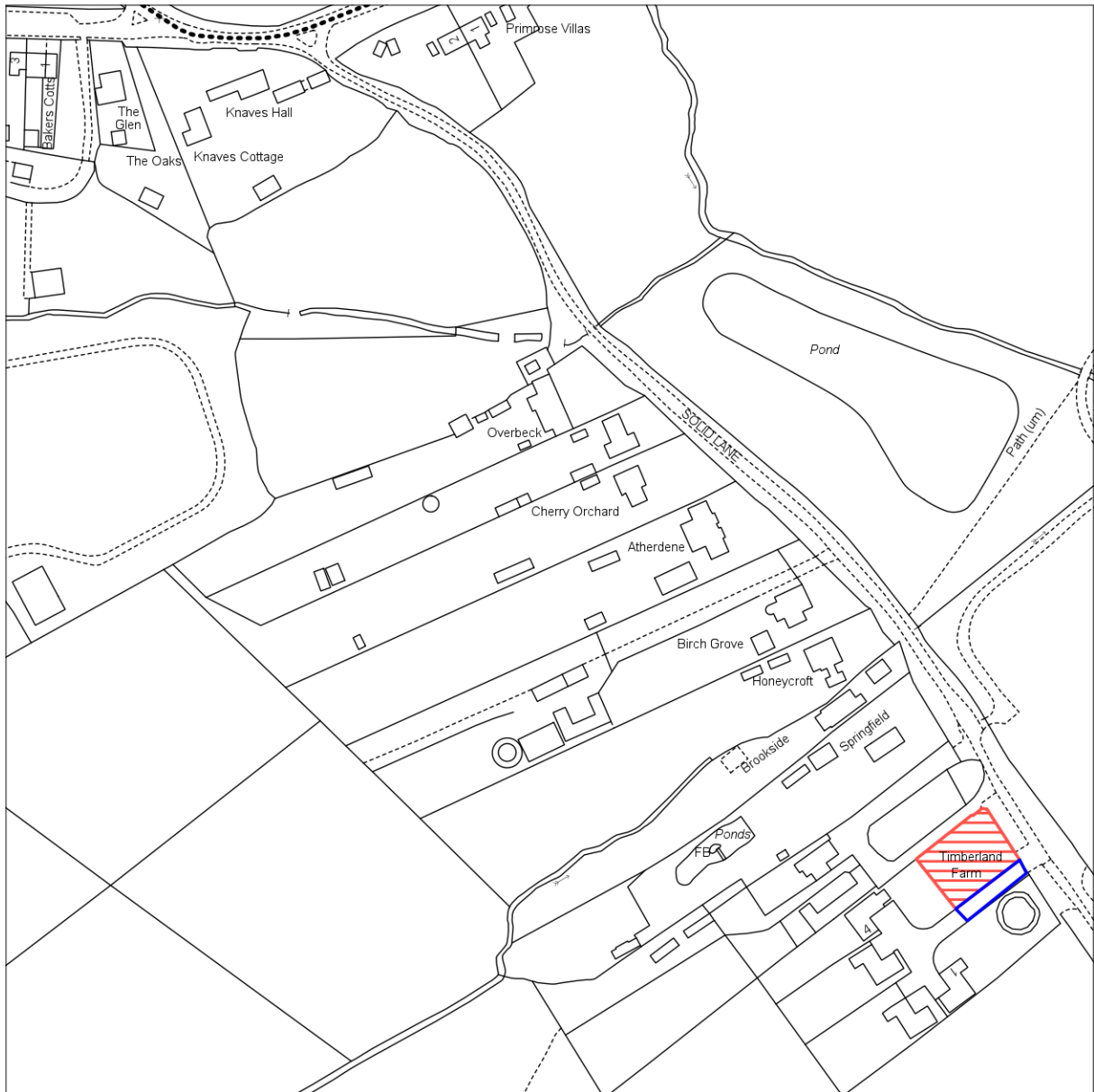
Timberland Farm, Solid Lane, Doddinghurst, Brentwood