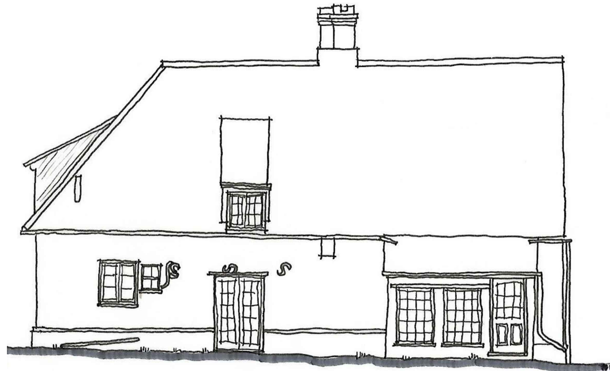
Existing Rear Elevation Scale: 1:100@A3

Roof: Clay tiles Walls: Bricks stretcher bond painted finish Joinery: Timber RWG's: Upvc