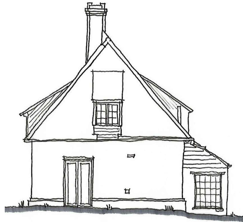
Existing Side Elevation Scale: 1:100@A3