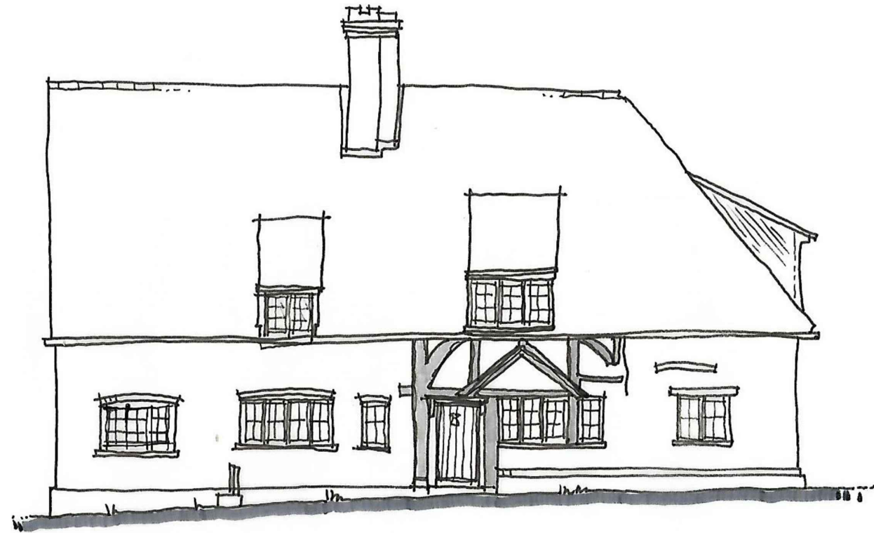
Existing Front Elevation Scale: 1:100@A3

Roof: Clay tiles Walls: Bricks stretcher bond painted finish Joinery: Timber RWG's: Upvc