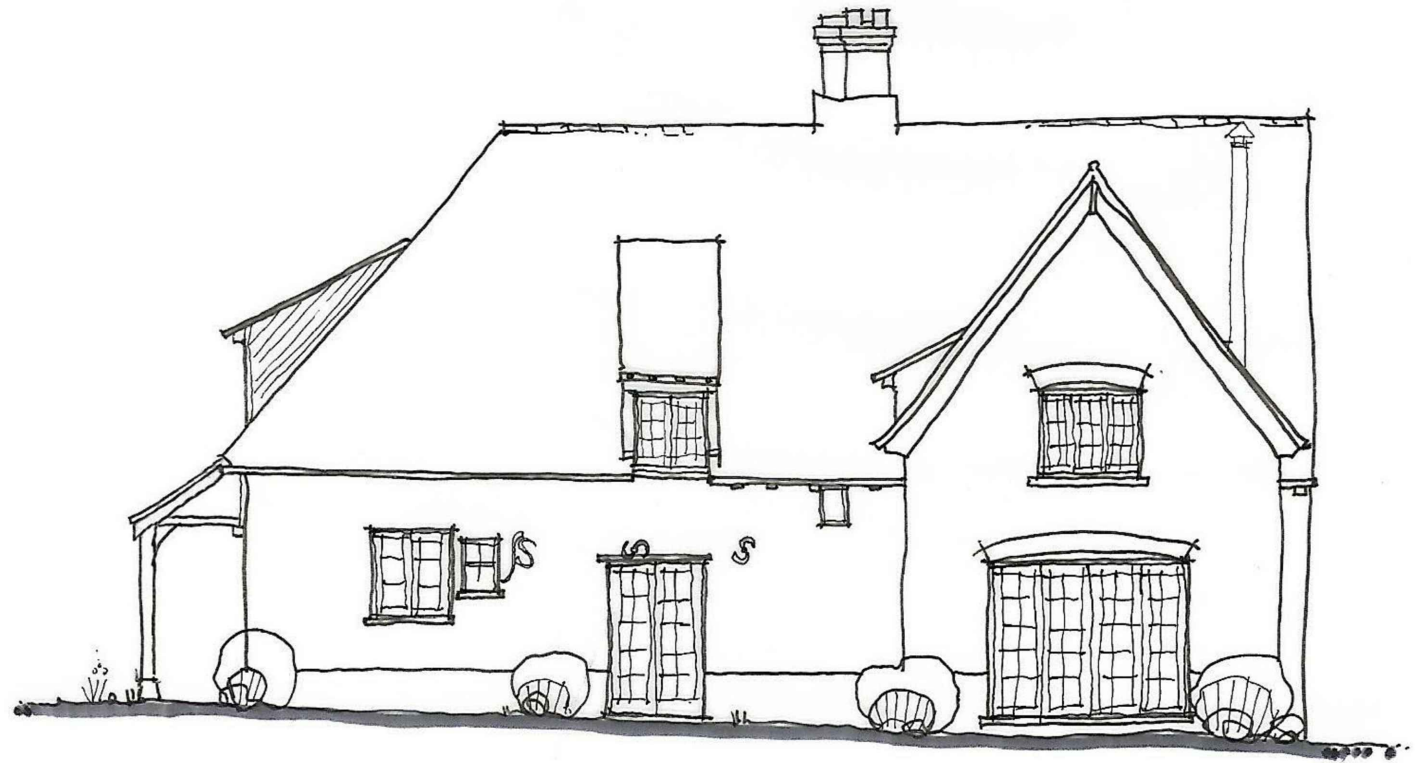
Proposed Rear Elevation Scale: 1:100@A3