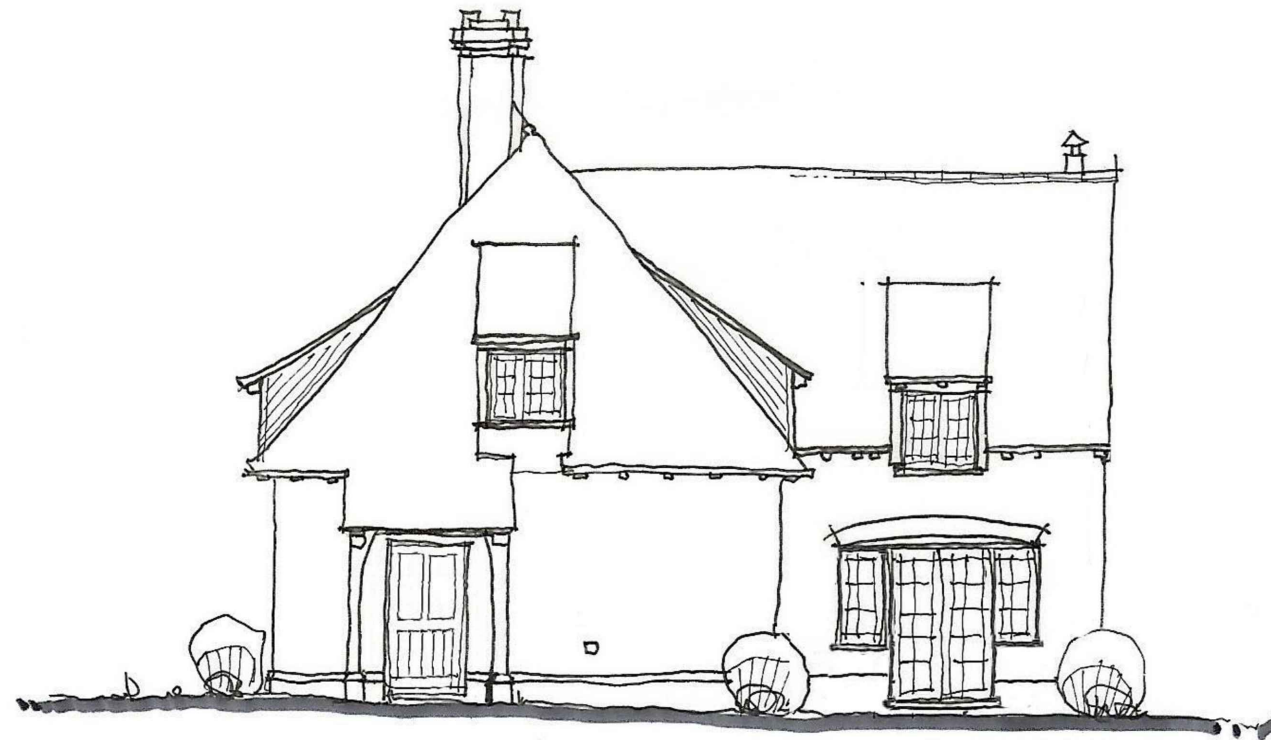
Proposed Side Elevation Scale: 1:100@A3