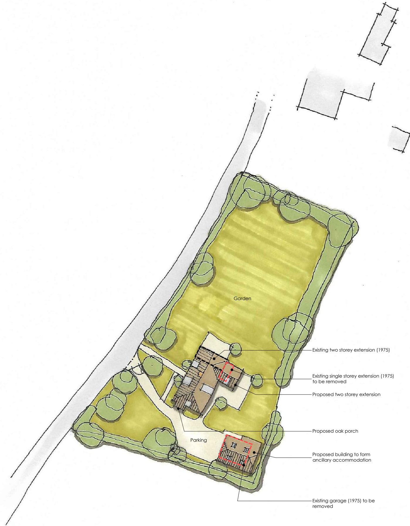
Proposed Site Block Plan Scale: 1:500@A3