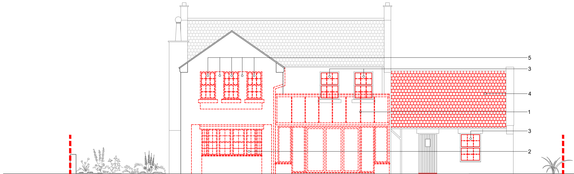
02 Existing North Elevation 1:100