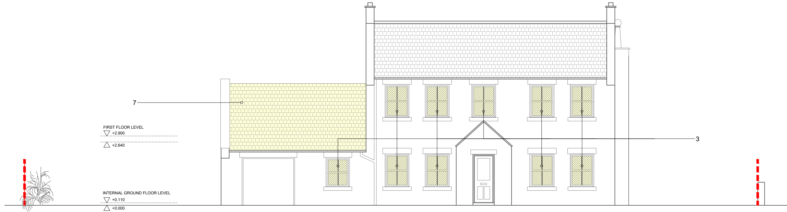
01 Proposed South Elevation 1:100