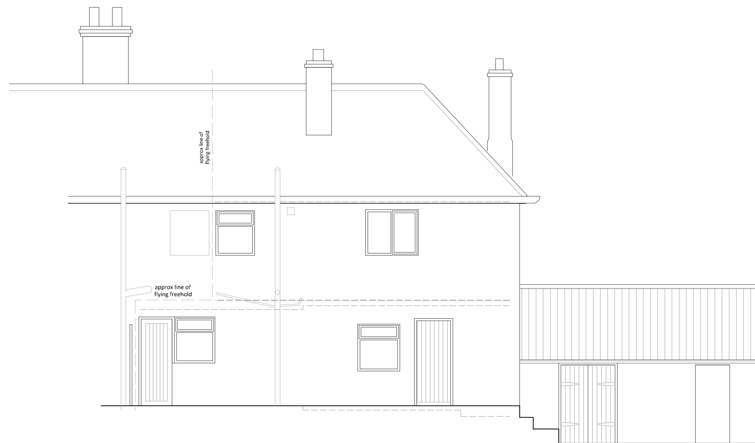
REAR ELEVATION AS EXISTING 1:50