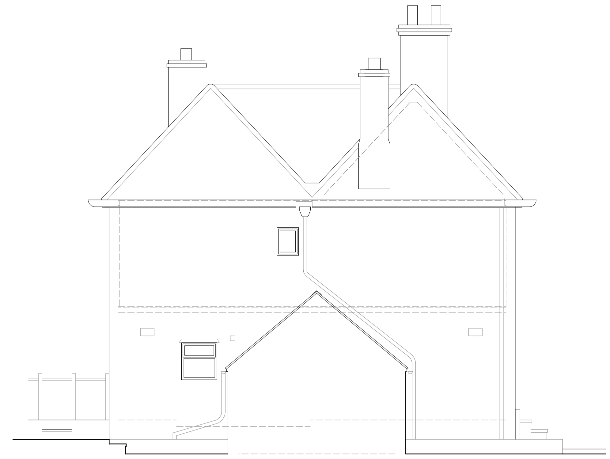
SIDE ELEVATION AS EXISTING 1:50