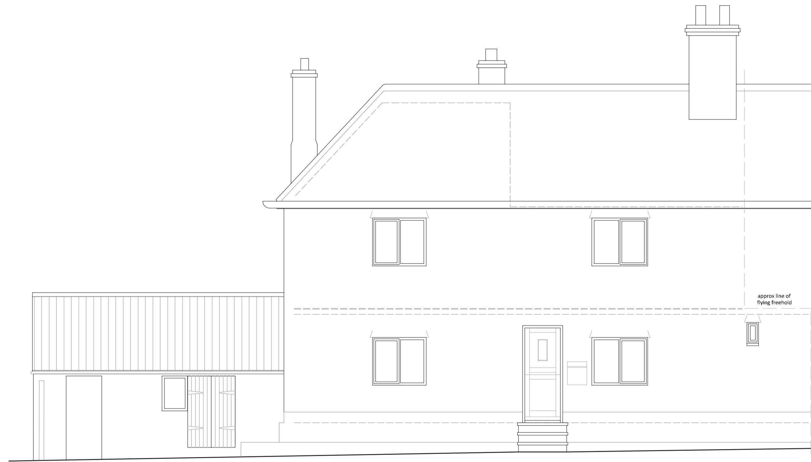
FRONT ELEVATION AS EXISTING 1:50