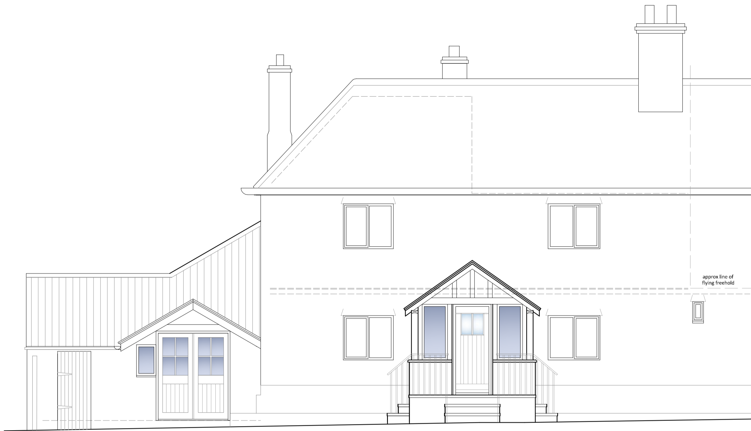
FRONT ELEVATION AS PROPOSED 1:50