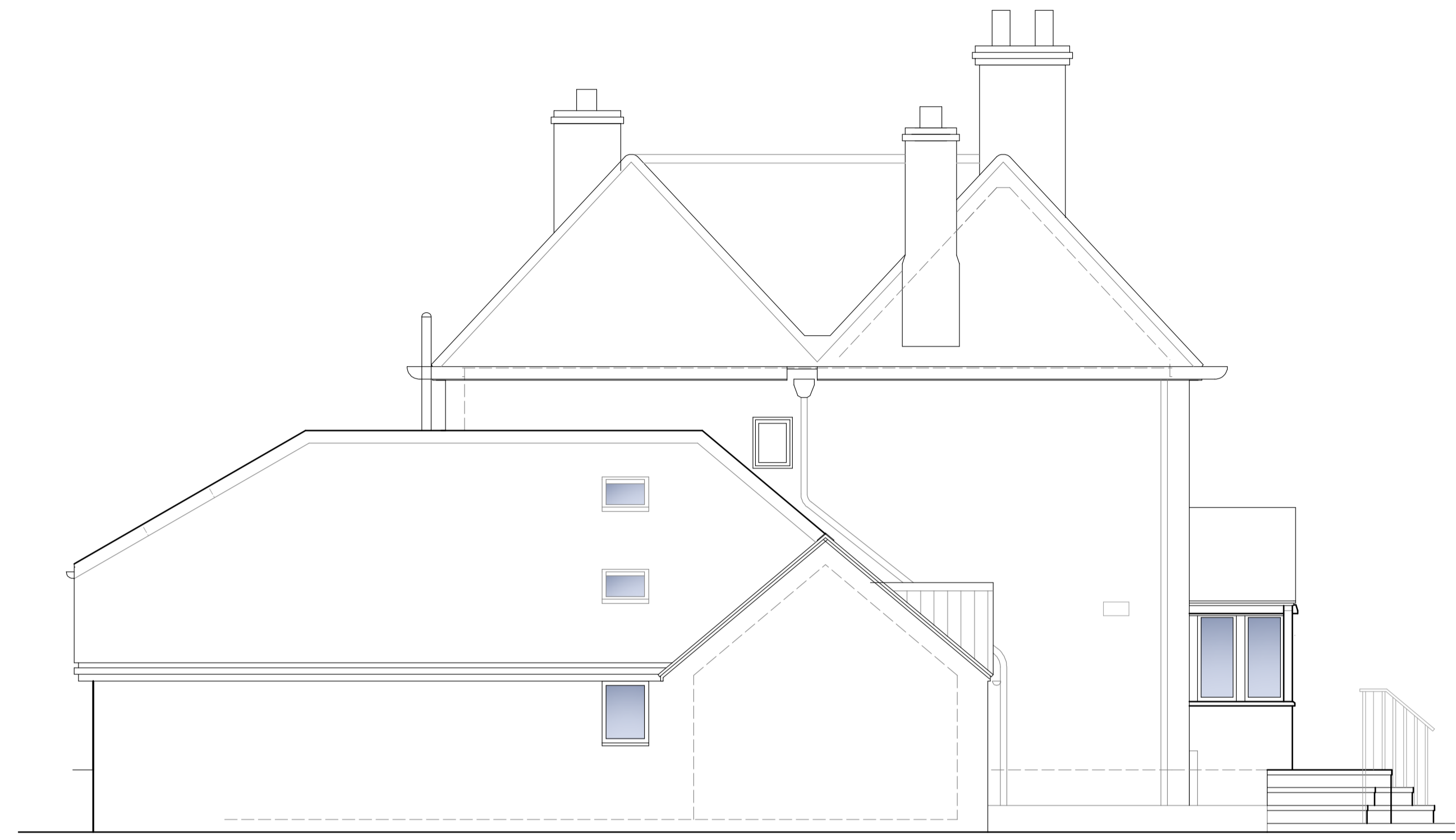
SIDE ELEVATION AS PROPOSED 1:50