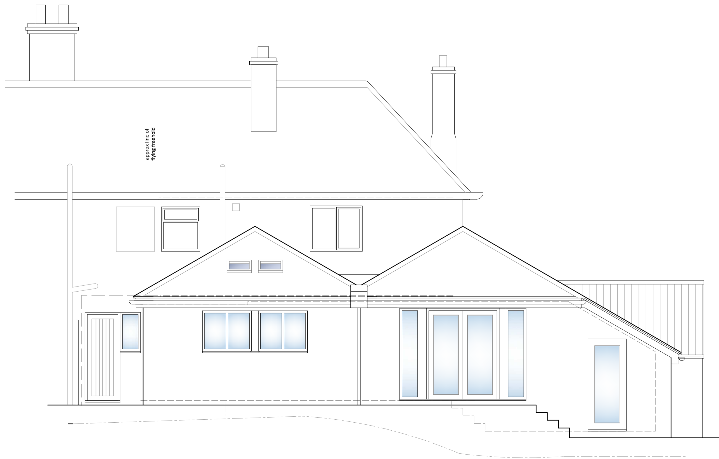
REAR ELEVATION AS PROPOSED 1:50