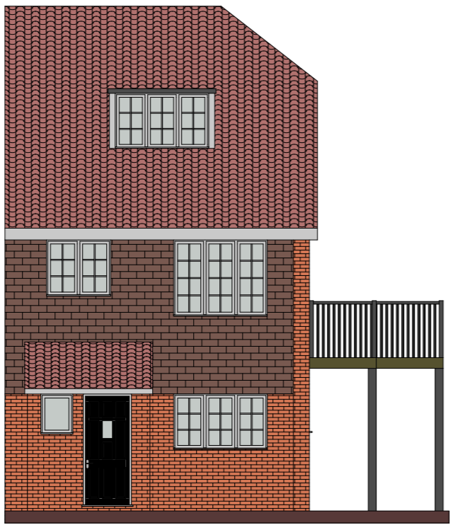
1 Proposed Front Elevation 1:100