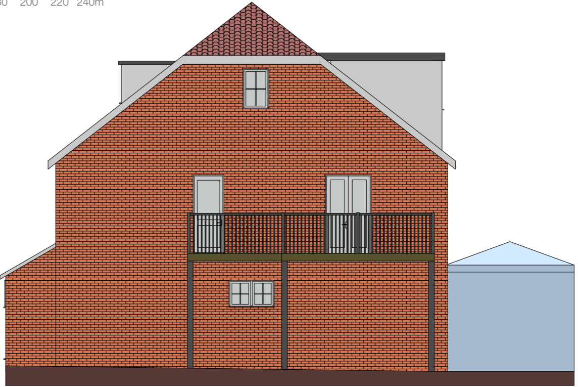
2 Proposed Side Elevation 1:100