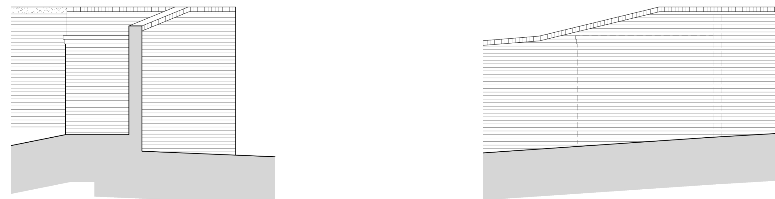
EXISTING & PROPOSED REAR AND RIGHT FLANK ELEVATIONS - 1:50