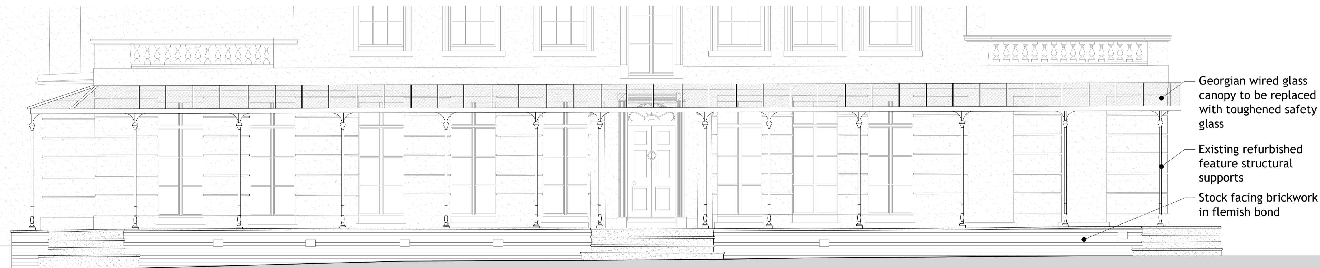
EXISTING & PROPOSED FRONT ELEVATION - 1:50