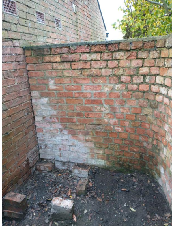
Figure 3: Proposed location of heat-pump.