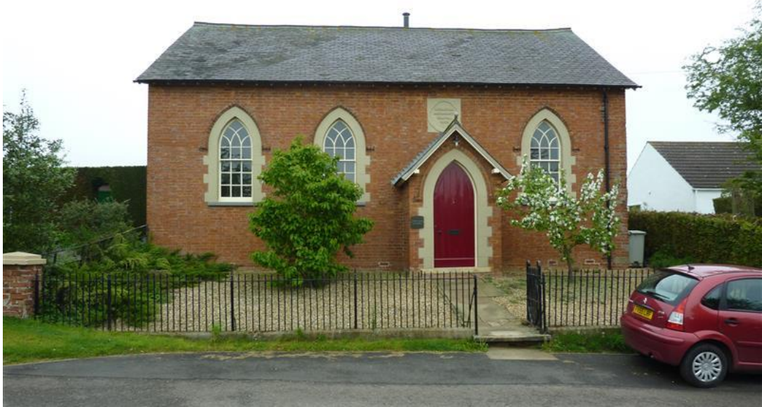
Figure 1: Present day view of Old Chapel, Hemingby