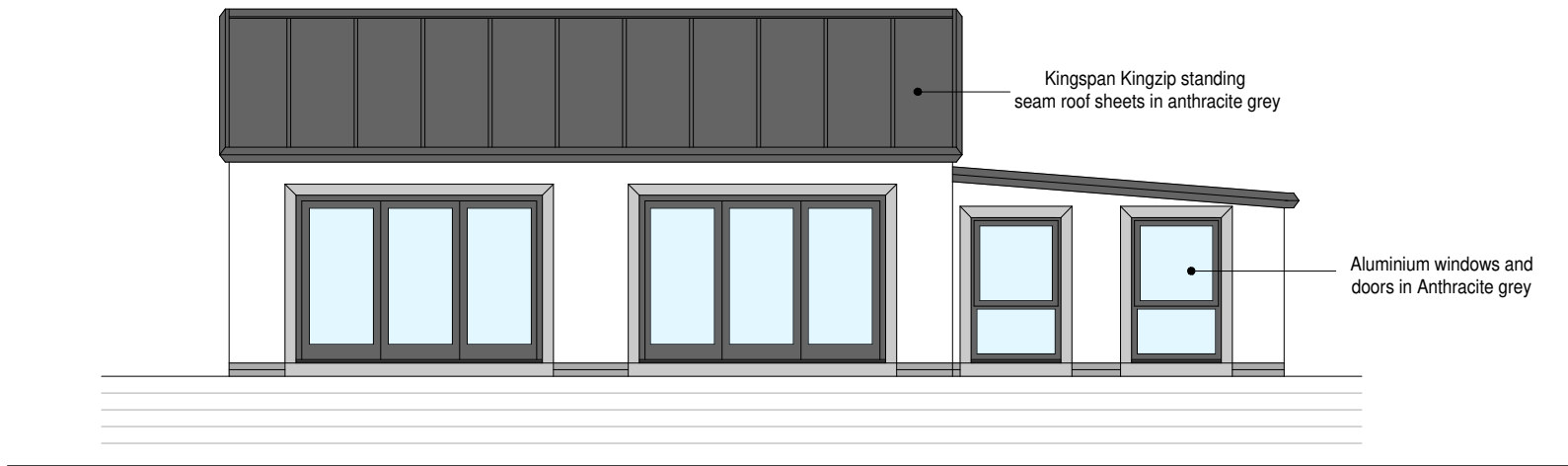
PROPOSED SOUTH ELEVATION (scale 1:100)

Sean McLean Design 22 Portrack Grange Road, Stockton-on-Tees, TS18 2PH Tel : 07711127641 E-mail smdesign@tiscali.co.uk PROPOSED DEVELOPMENT AT ROSECOTE FARM, AISLABY ROAD FOR GARETH THOMAS PROPOSED ELEVATIONS SHEET 1 OF 2 Drg. No. 2294/PL/08 'A' Date JUN 22