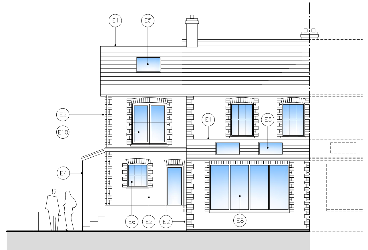
rear elevation (south east)