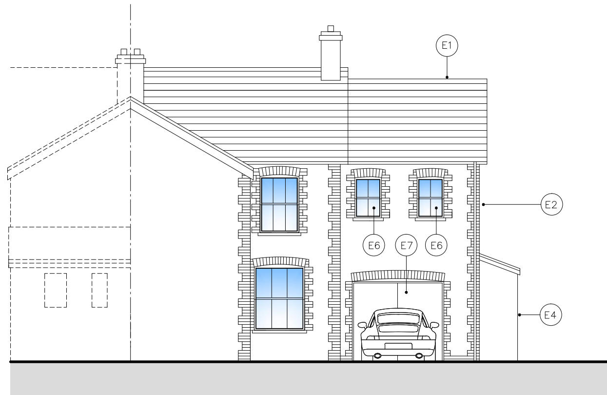
front elevation (north west)