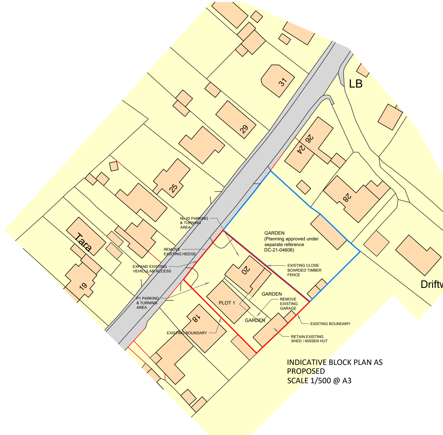
INDICATIVE BLOCK PLAN AS PROPOSED SCALE 1/500 @ A3