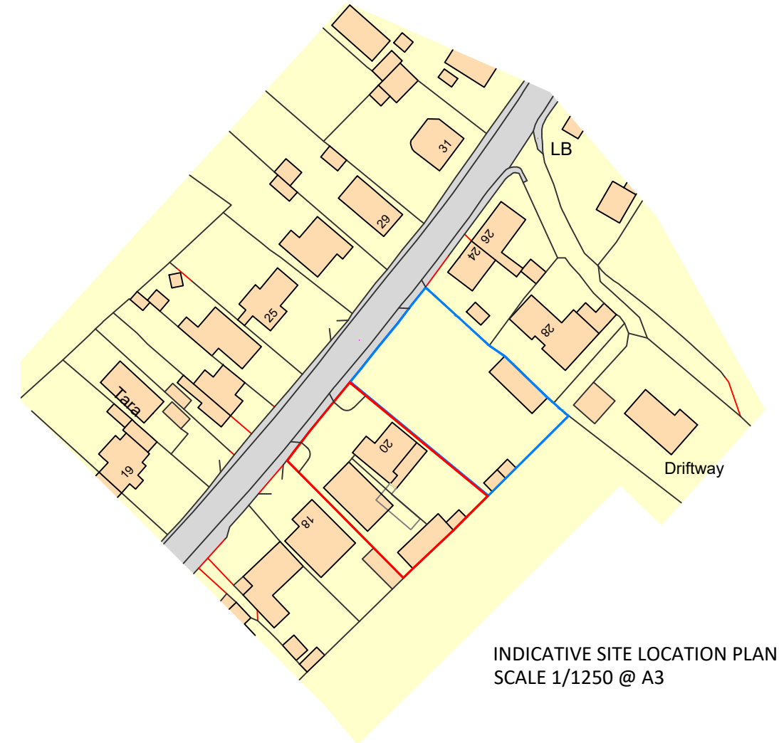
INDICATIVE SITE LOCATION PLAN SCALE 1/1250 @ A3

Ordnance Survey, (c) Crown Copyright 2021. All rights reserved. Licence number 100022432