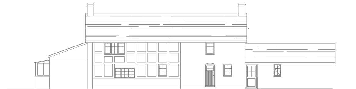
FRONT (NORTH WEST)