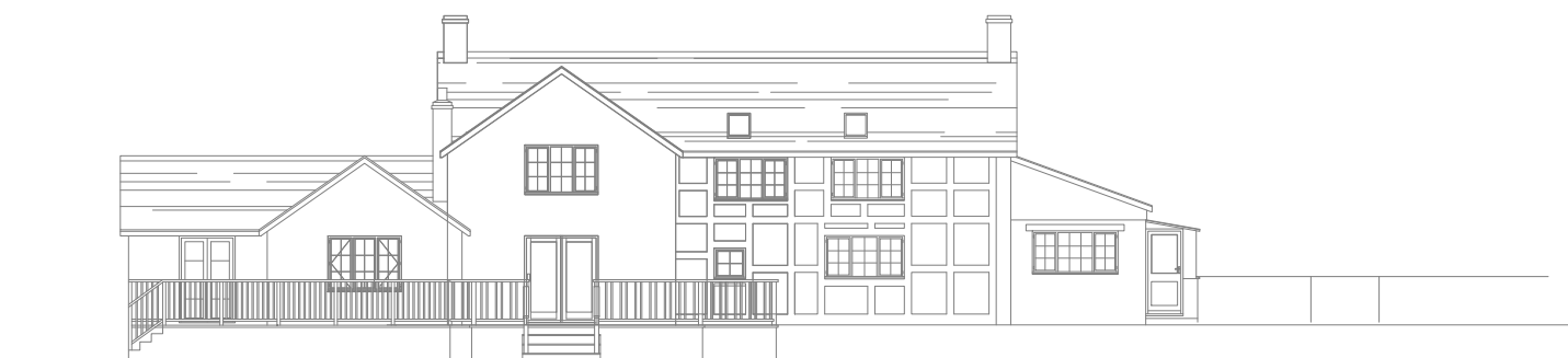
REAR (SOUTH EAST)