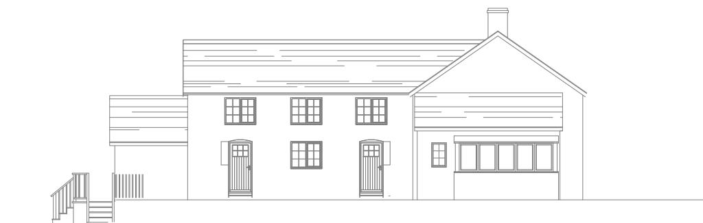
SIDE (NORTH EAST)