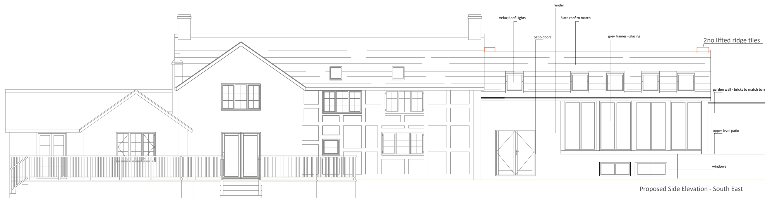
Proposed Side Elevation - South East