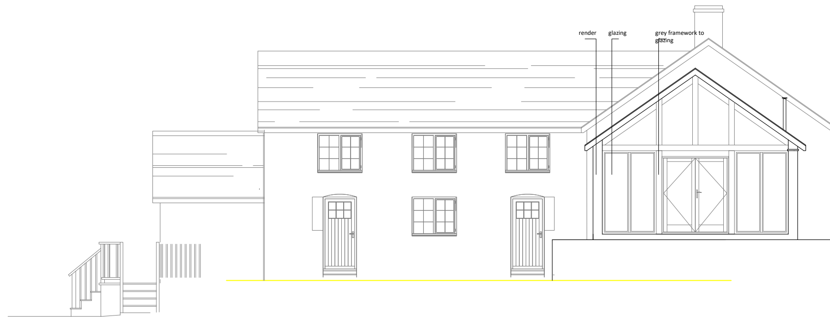
Proposed Rear Elevation - North East