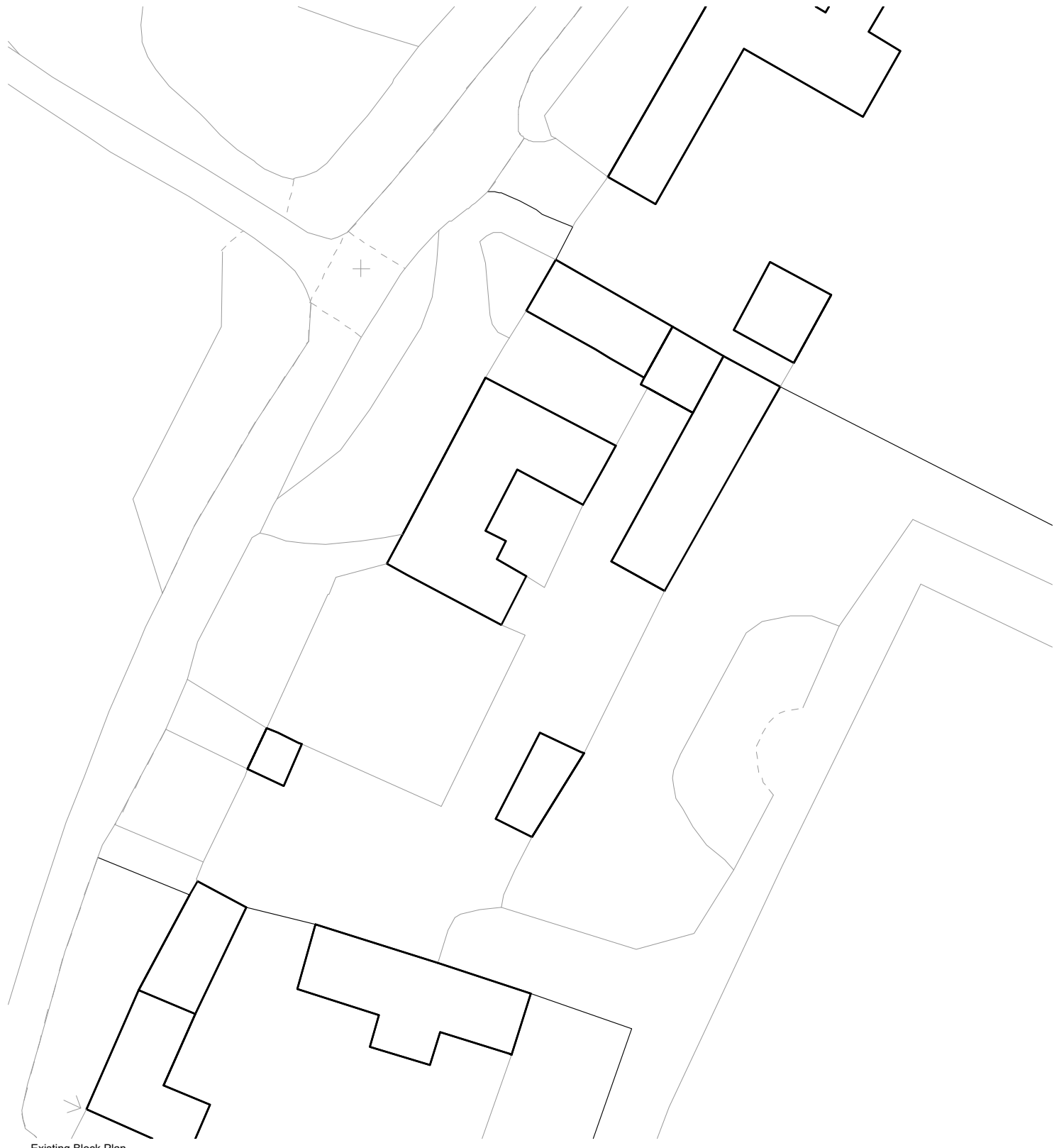
Existing Block Plan