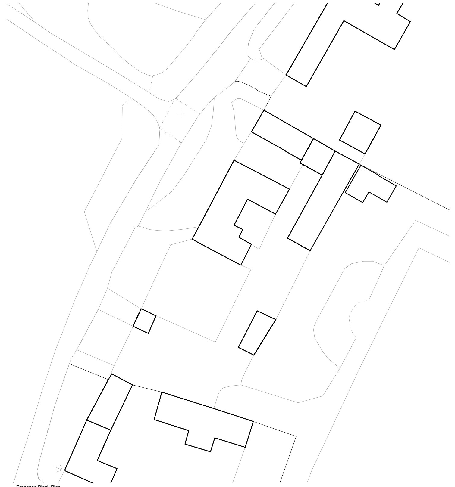
Proposed Block Plan