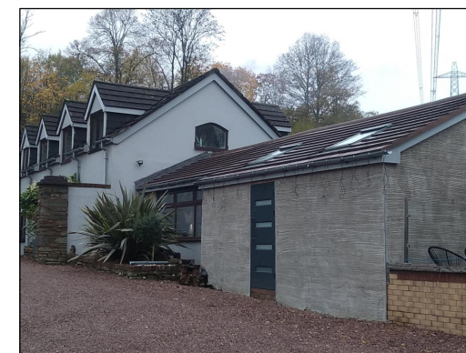
Front Elevation of External Kitchen (South East)