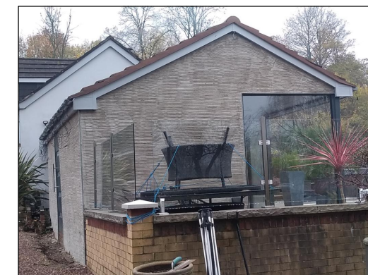
End Elevation of External Kitchen (North East)