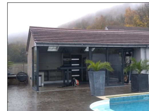
Rear Elevation of External Kitchen (North West)