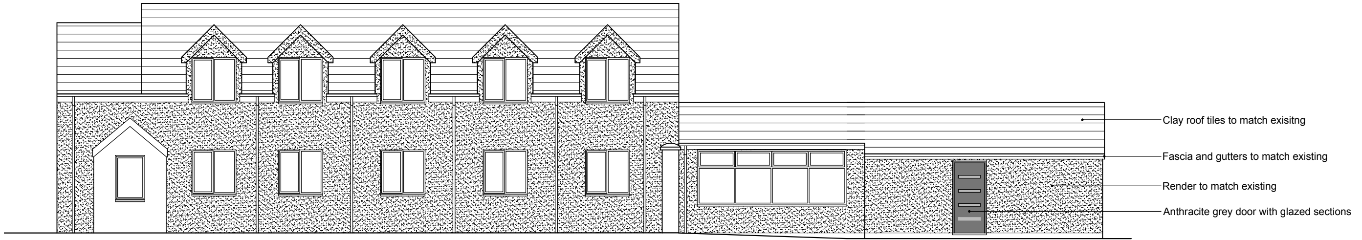
Elevation 1 South East