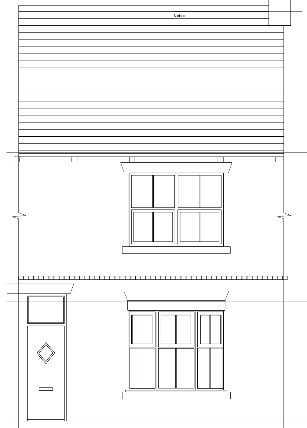
Existing Front Elevation 1:50