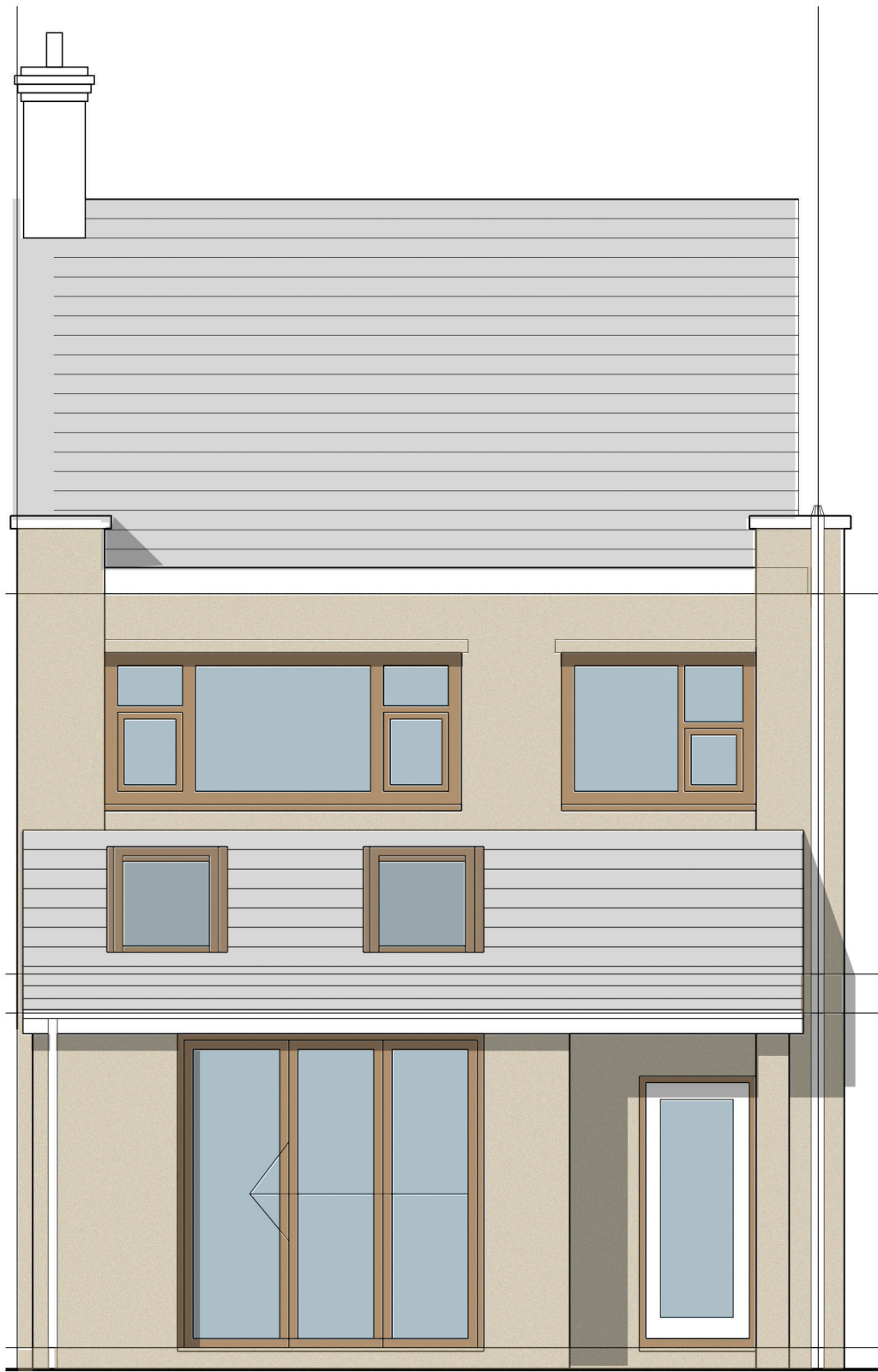
Proposed South Elevation