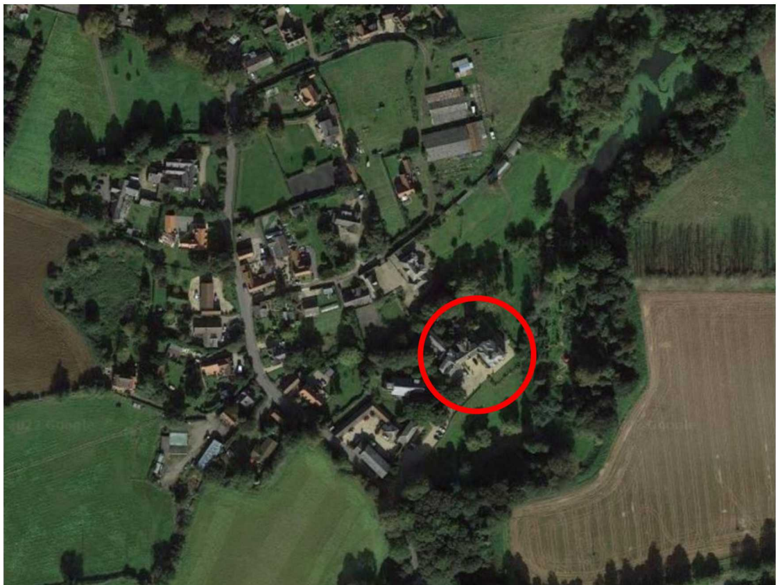
FIGURE 1: Aerial photograph highlighting location of site.