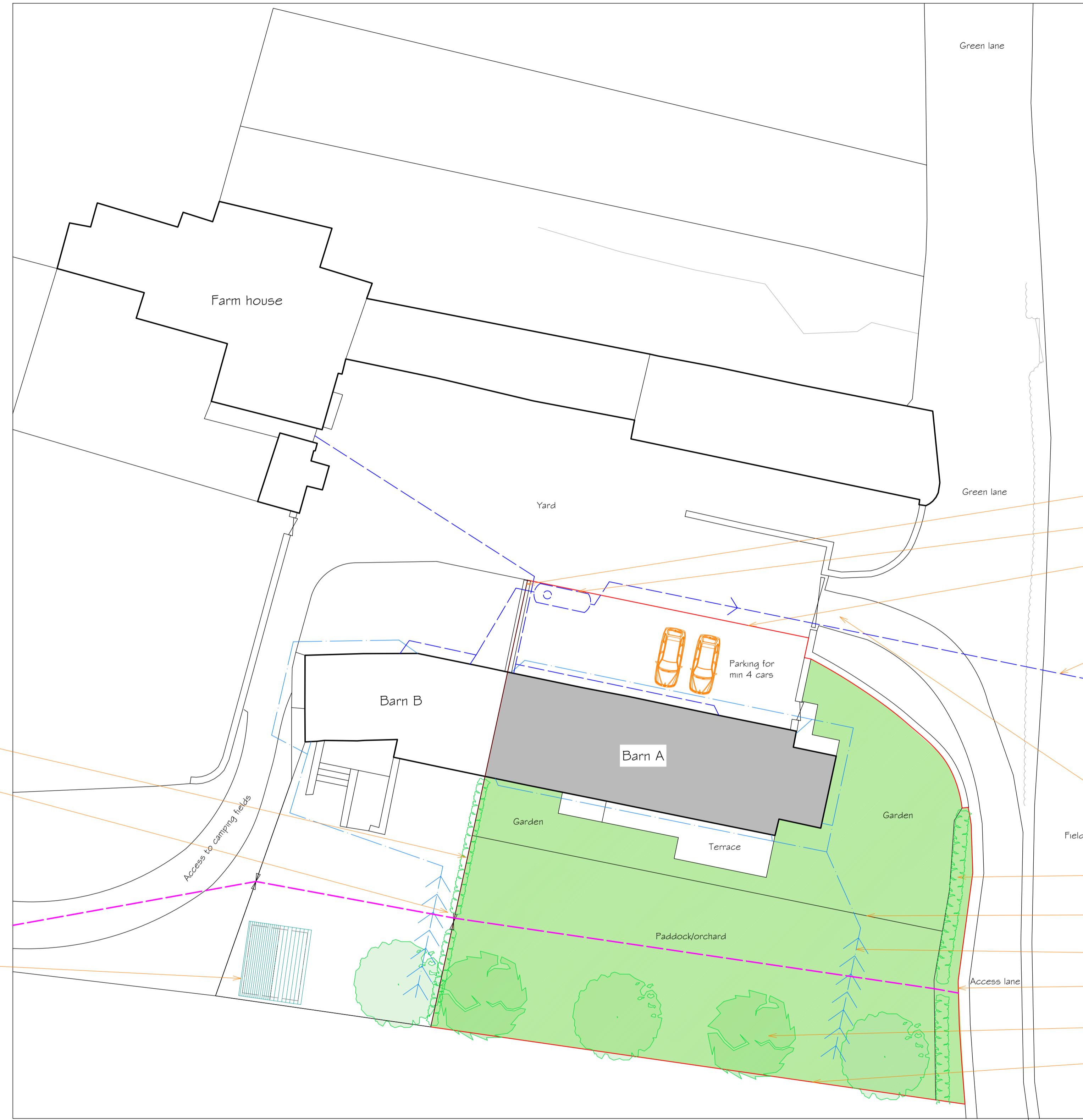
Site plan as proposed 1:200

© Crown copyright and database rights 2021 OS 100038864 Reproduction in whole or in part is prohibited without the permission of Ordnance Survey.