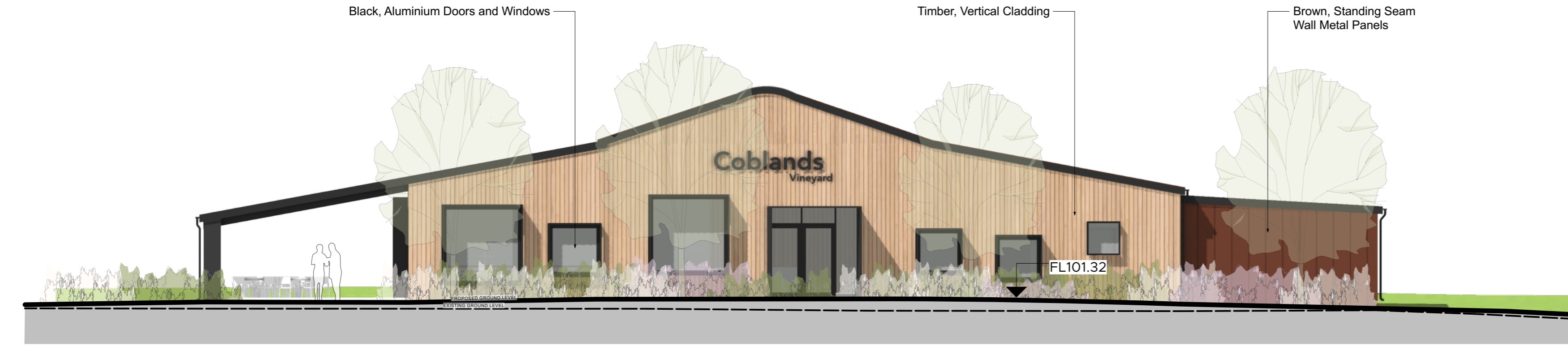
3 PROPOSED SOUTH ELEVATION Scale: 1:100