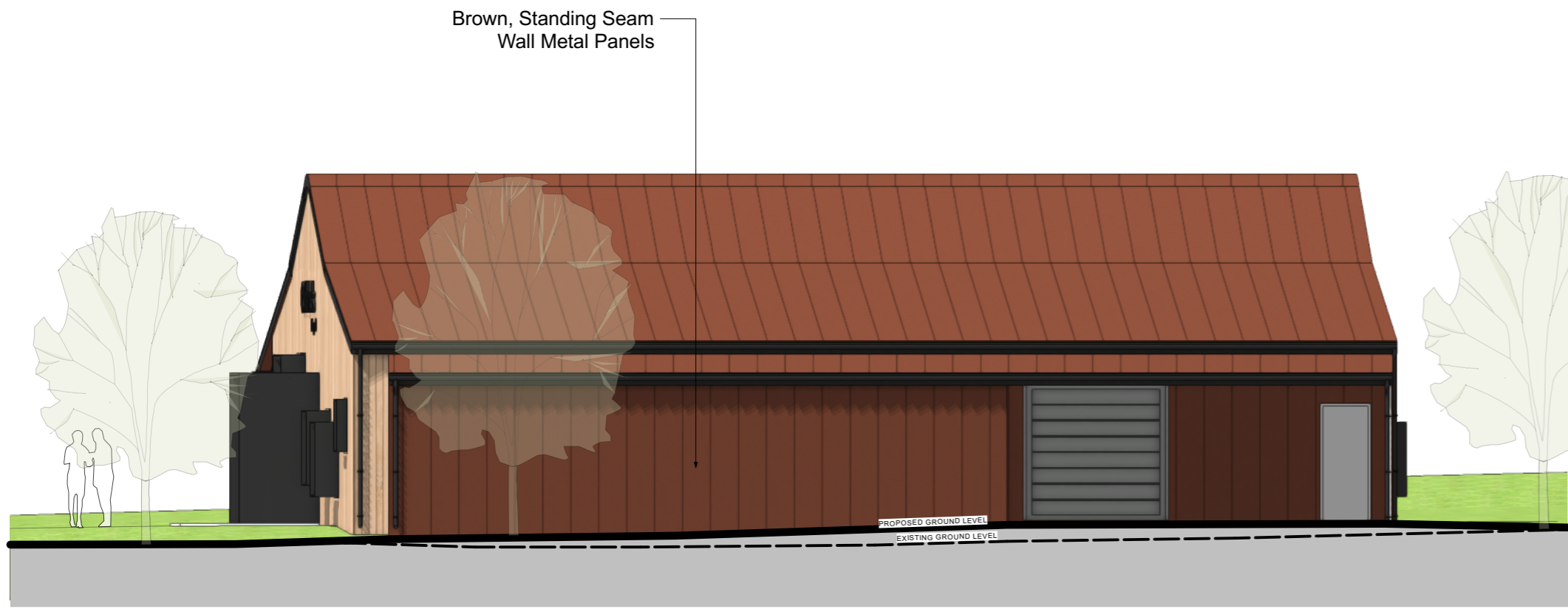
1 EAST ELEVATION Scale: 1:100