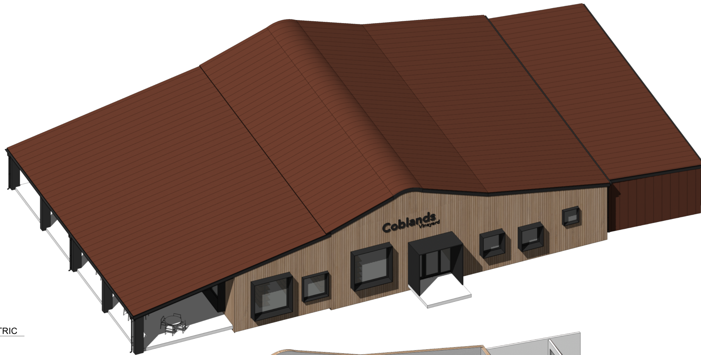
1 ROOF AXONOMETRIC Scale: 1:100