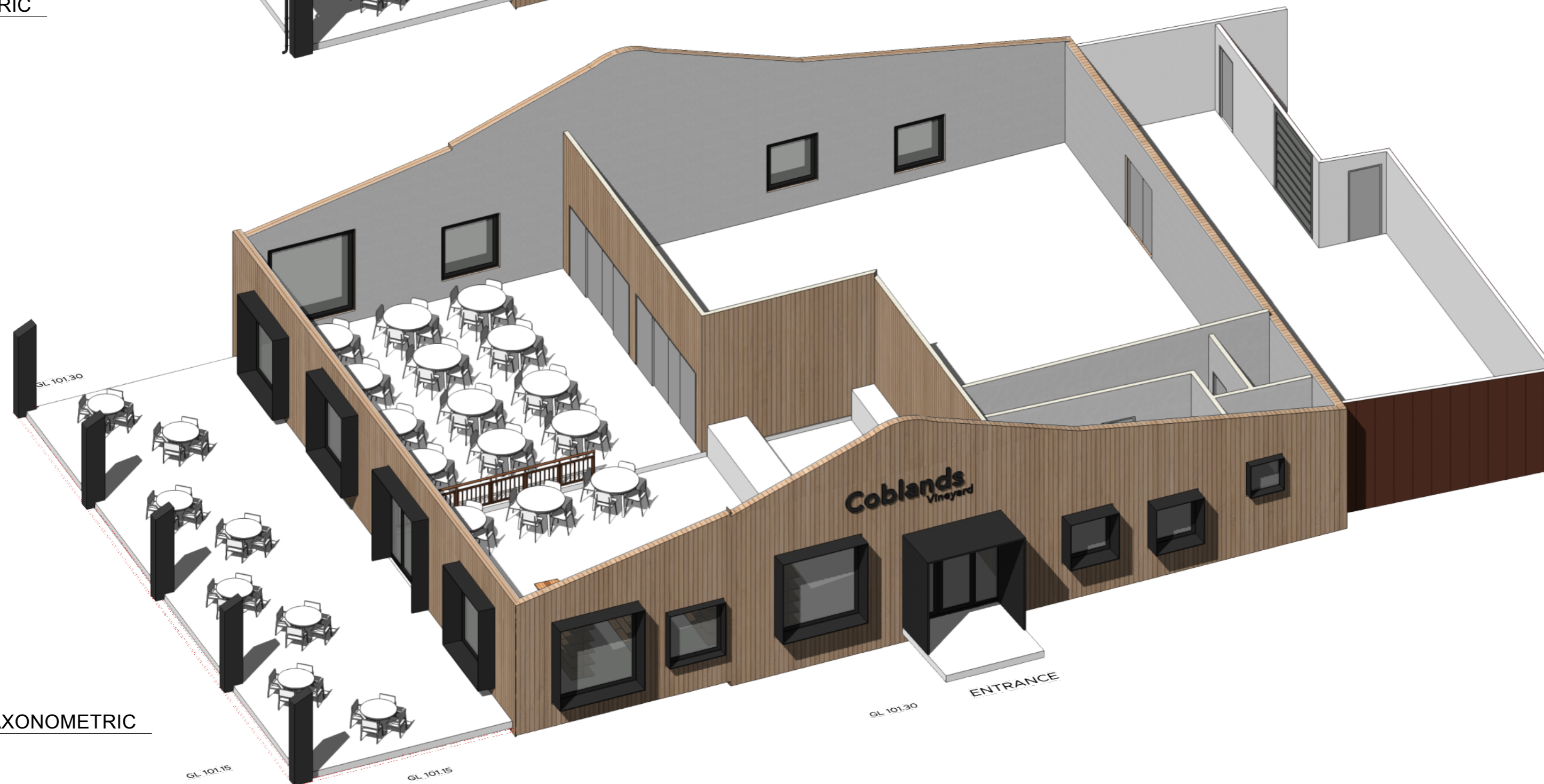
2 GROUND FLOOR AXONOMETRIC Scale: 1:100