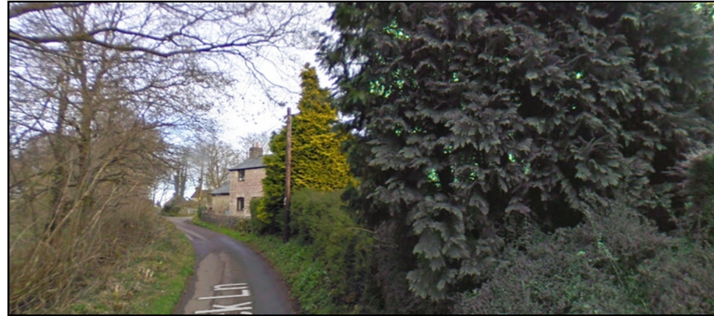
VIEW HEADING EAST ON BACK LANE