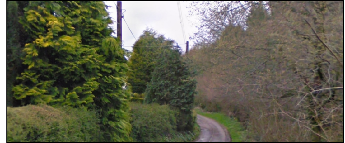
VIEW HEADING WEST ON BACK LANE

Below are shown some photos of the other accillary buildings in the area with there locations marked on MAP2 above to give context.