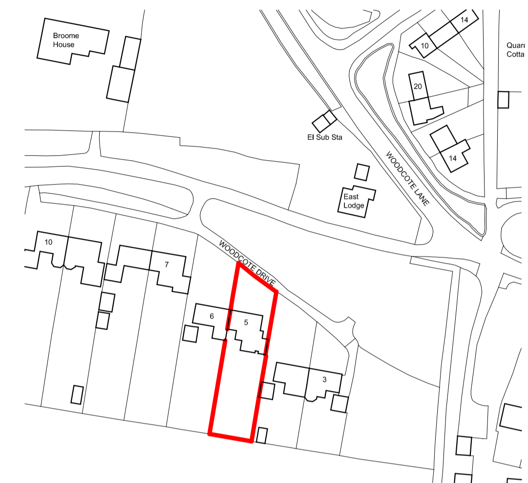
Proposed Location Plan - 1:1250 @ A1

Ordnance Survey, (c) Crown Copyright 2022. All rights reserved. Licence number 100022432