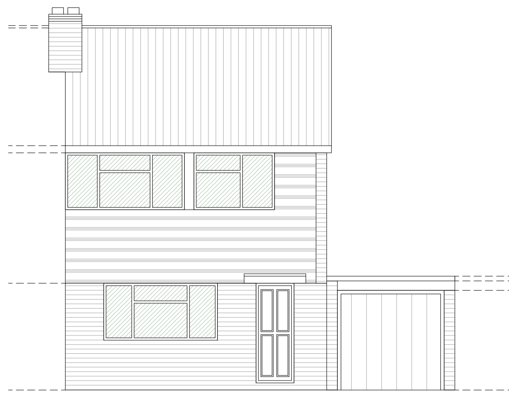
1 Existing Front Elevation 1:50