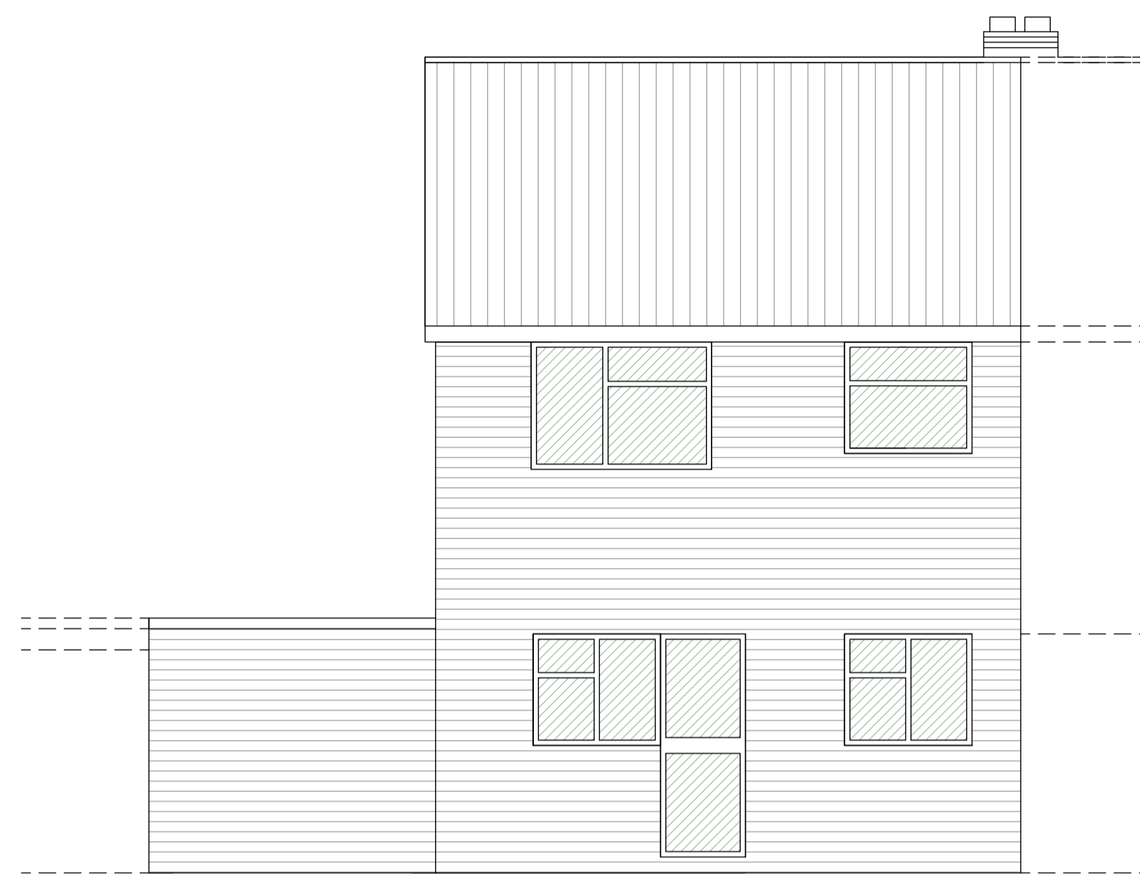
2 Existing Rear Elevation 1:50