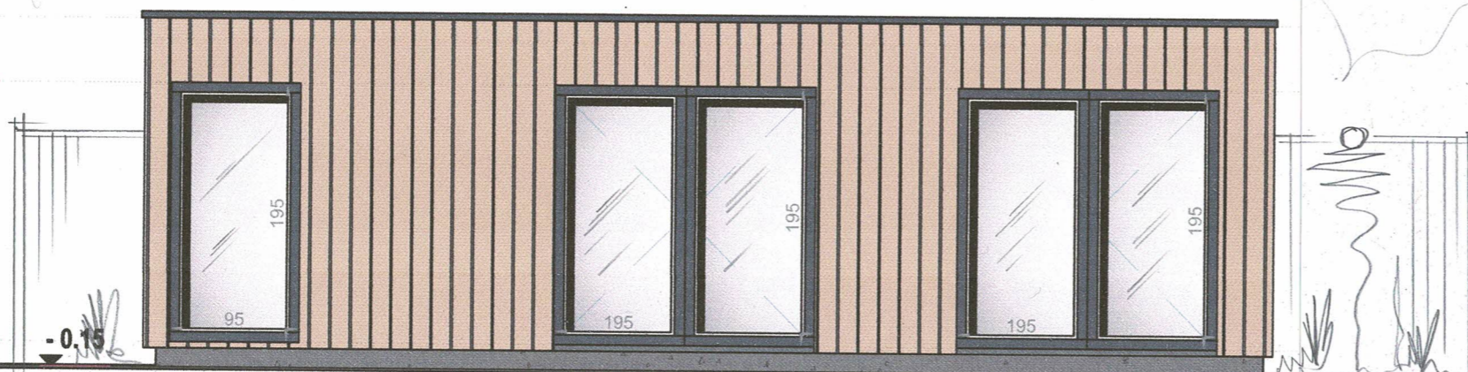
PROPOSED FRONT - NORTH ELEVATION