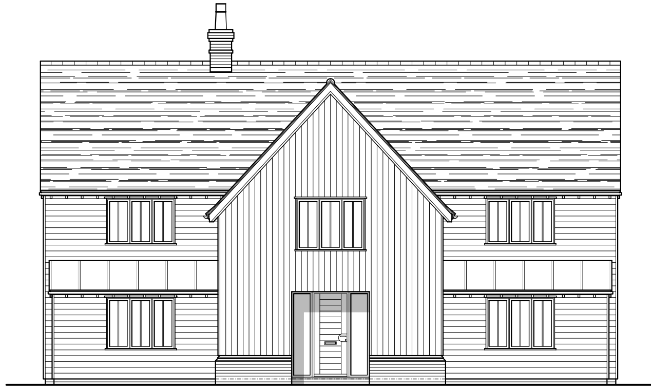
Proposed Front Elevation - 1:100