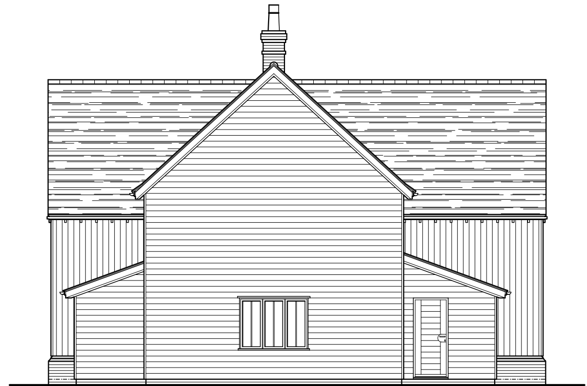
Proposed Side Elevation - 1:100