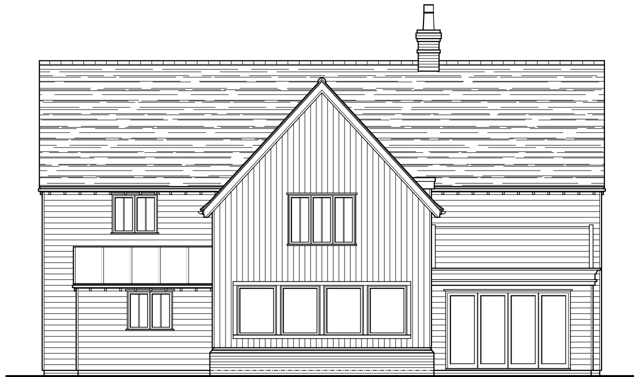
Proposed Rear Elevation - 1:100