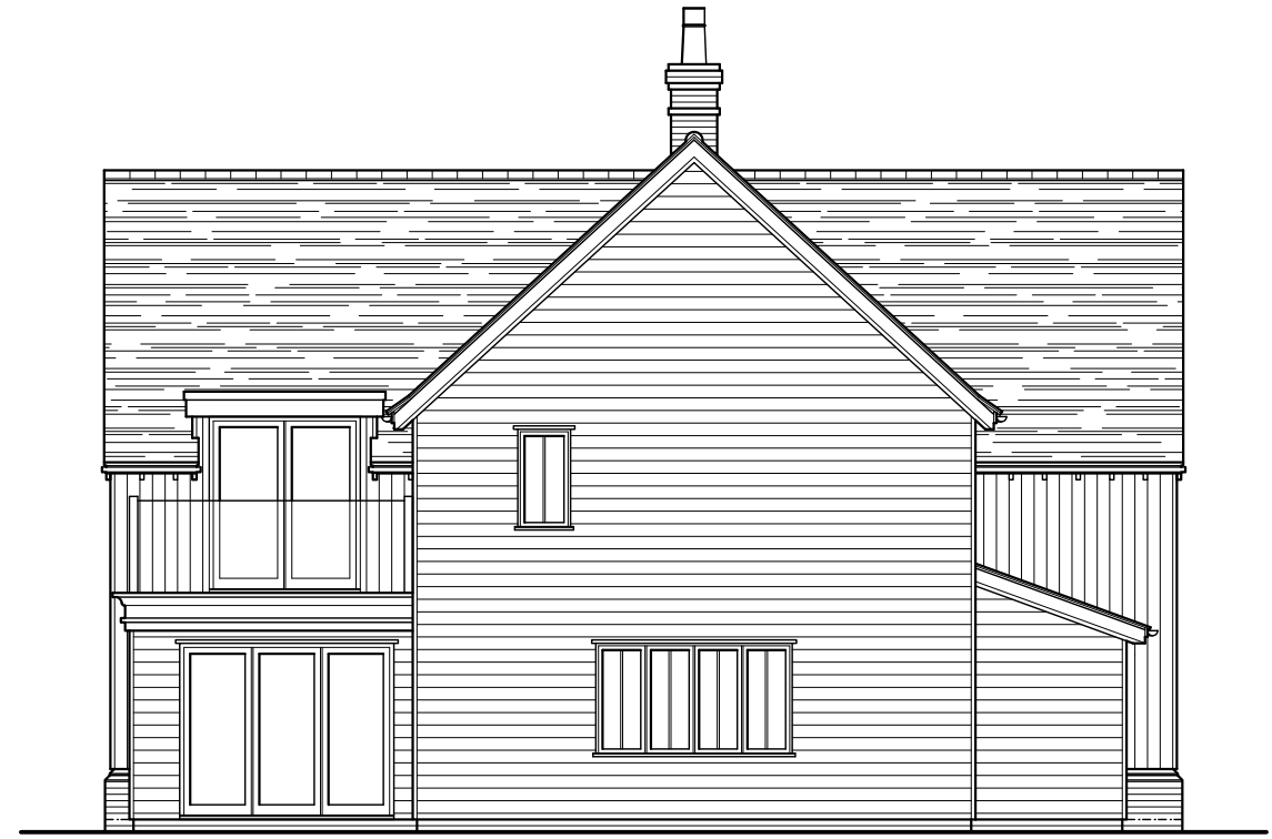
Proposed Side Elevation - 1:100